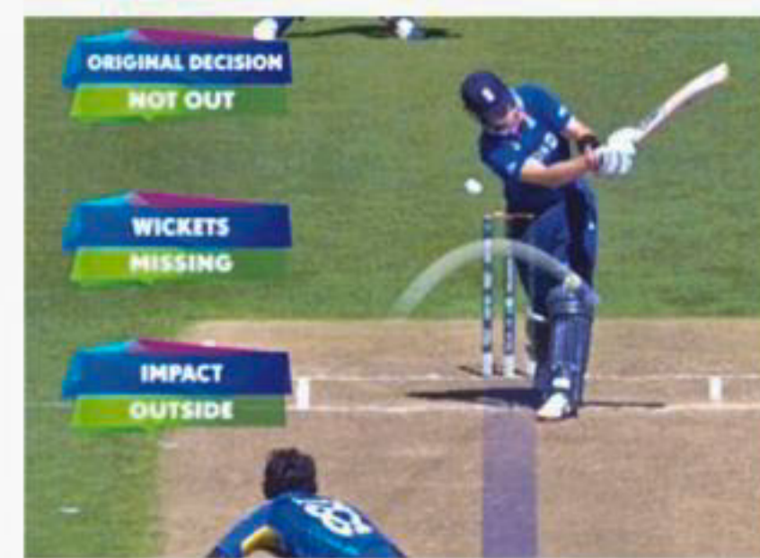
The two countries faced off in Wellington on Sunday, with England

Sri Lanka have made a bid for the worst review of all time in their World Cup match against England.