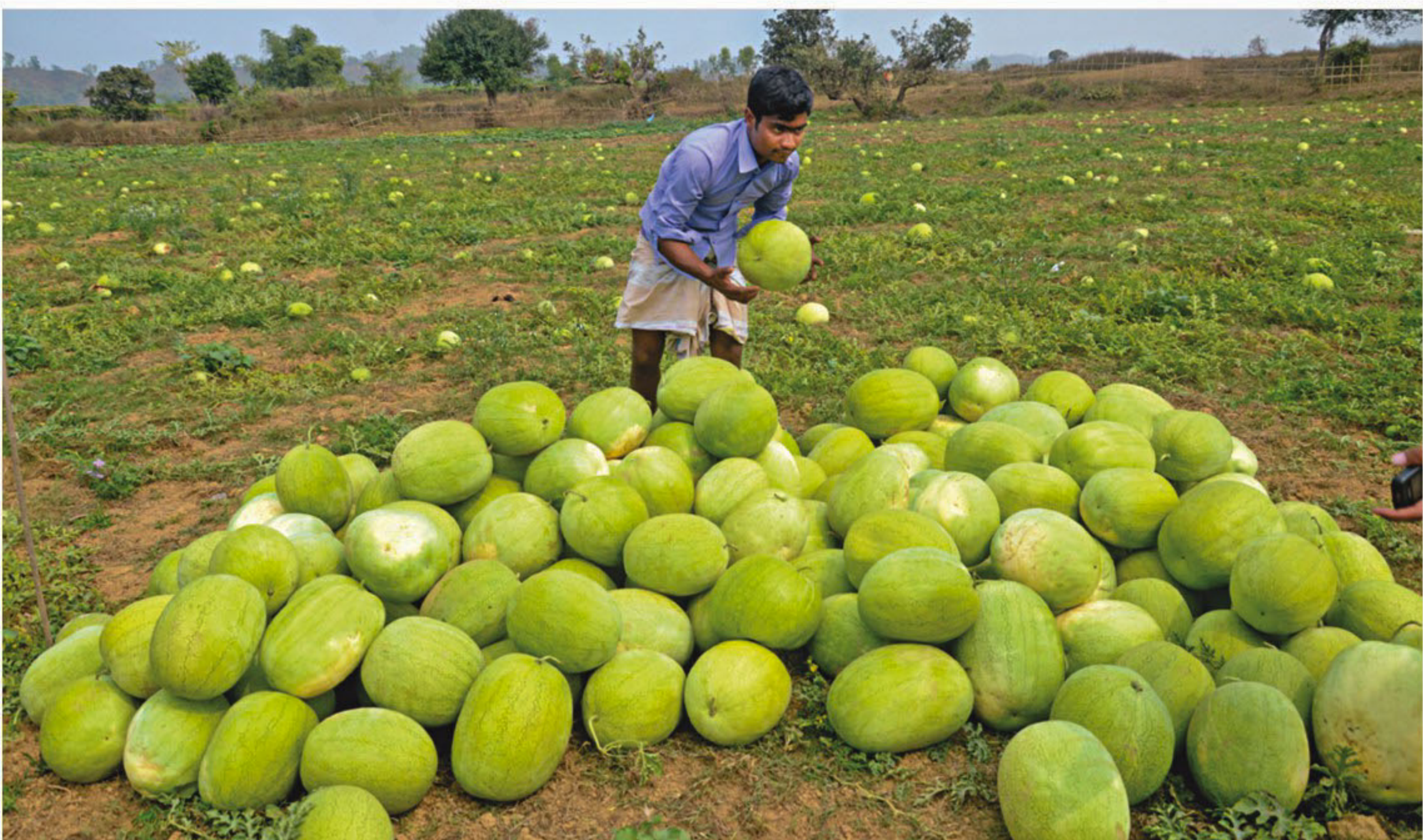
A farmer waiting for wholesalers to come and buy his yield of watermelon from the field, in Jaintiapur upazila of Sylhet Wednesday. Around a hundred growers are facing losses because they have been forced to harvest the ripe fruits but failed to transport those to the market amid the ongoing countrywide blockade.