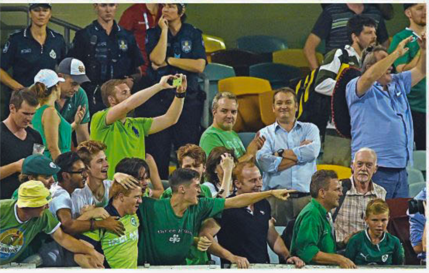
Irish fans celebrate with one of their own while UAE fans are let down once again. Bangladesh fans will be looking forward to another day of great cricket.