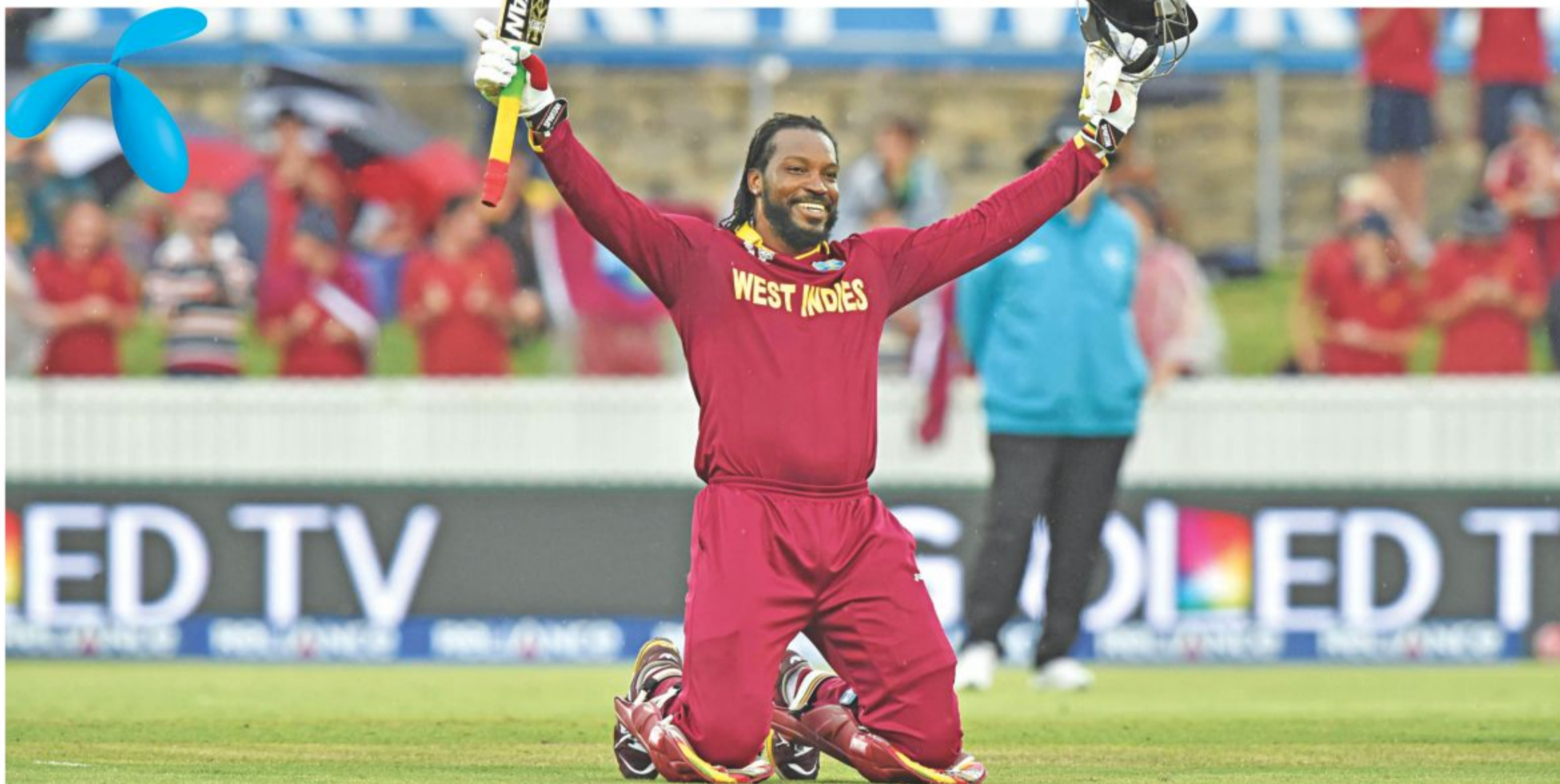
GAYLE FORCE IS BACK: Hard-hitting West Indies opener Chris Gayle takes a bow after his majestic 200, a first in World Cup history, against Zimbabwe at the Manuka Oval in Canberra yesterday.