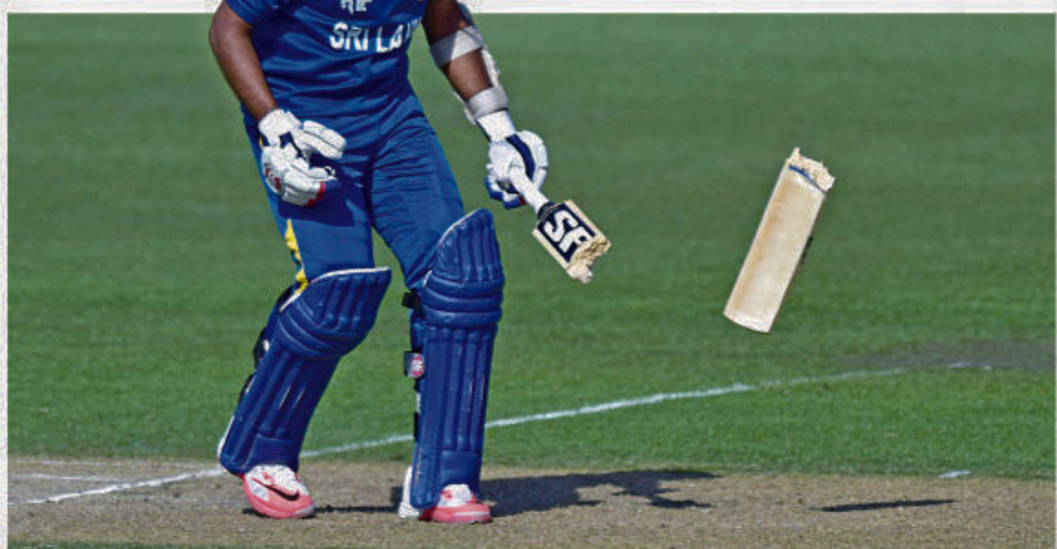
Master Sri Lanka batsman Mahela Jayawardene needed more than one bat to score a match-winning hundred against a spirited Afghanistan at the University Oval in Dunedin yesterday.