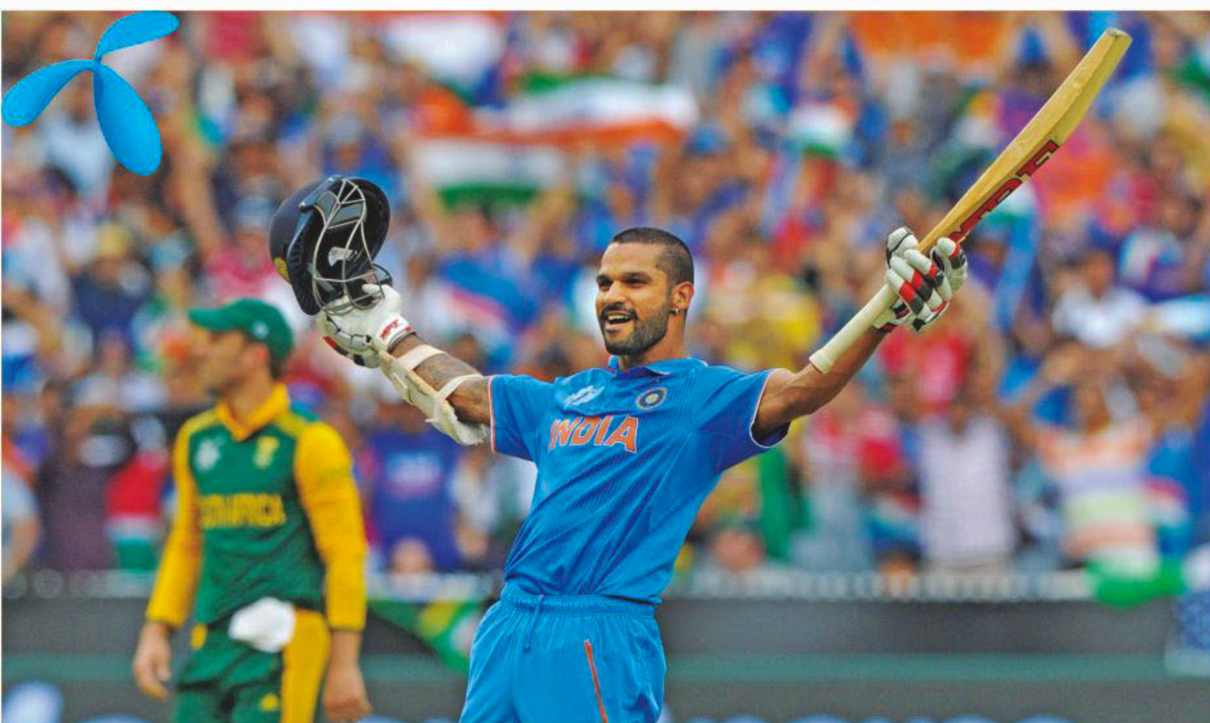
India's opening batsman Shikhar Dhawan spreads his arms wide open to celebrate his century against South Africa during their ICC World Cup clash at the Melbourne Cricket Ground yesterday.

JATIYA PARTY CHAIRMAN HM ERSHAD AT A DISCUSSION IN THE CITY