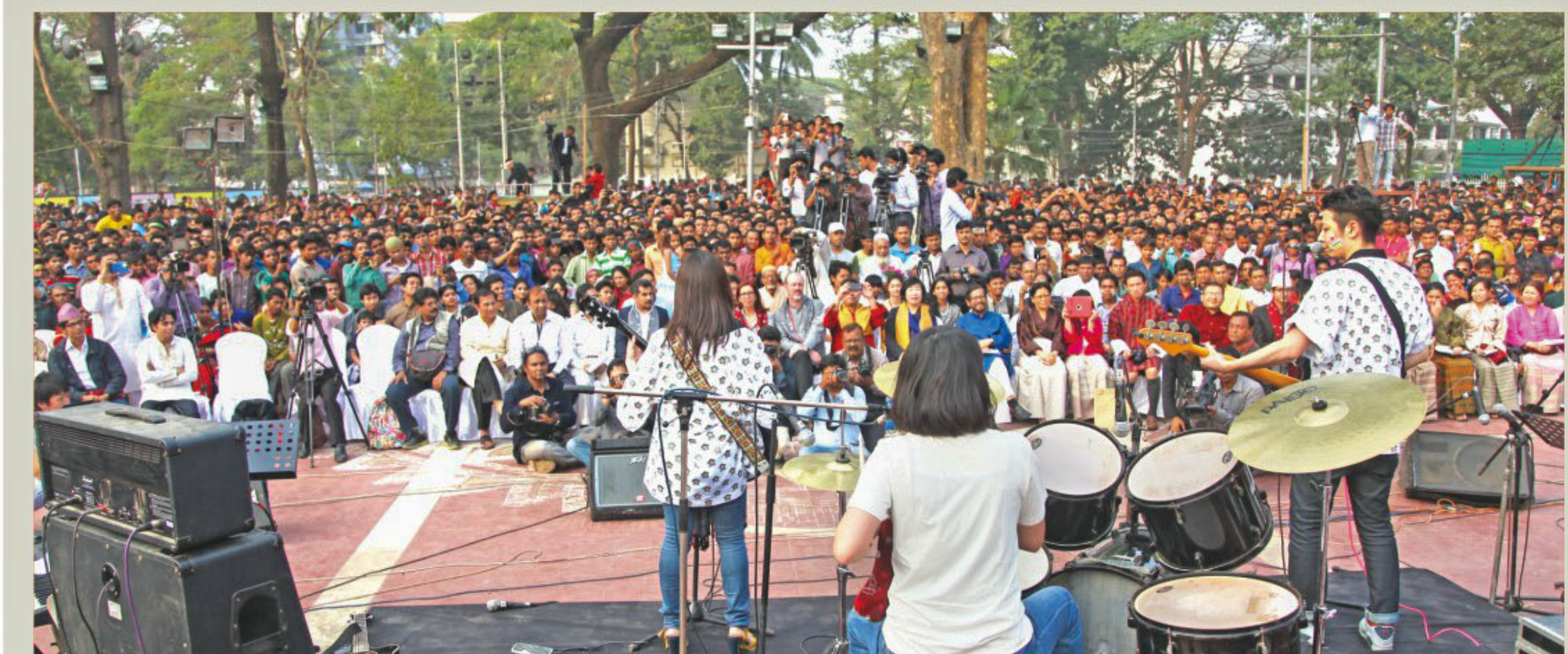
Japanese band YSBB performs at the Shaheed Minar, as part of Bangladesh Shilpakala Academy's programme on Ekushey February -- of songs and poems of various languages. Local and foreign artistes performed in various Asian, European as well as Bangladesh's indigenous languages.