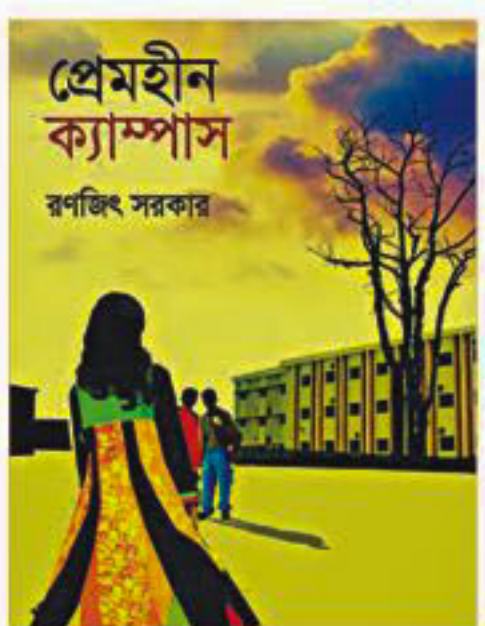
PREMHIN CAMPUS Author: Ranzit Sarker Publisher: Shobdoshoilo Price: BDT 150