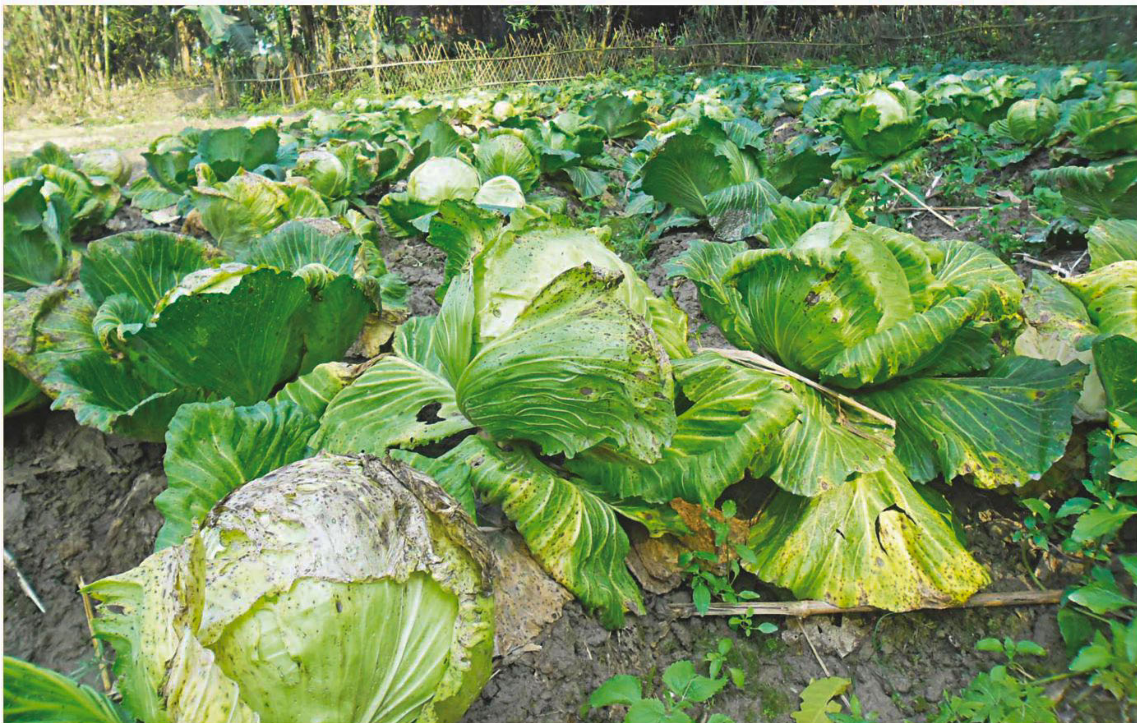
Farmers brace for mammoth losses as cabbages start perishing in the field instead of selling in the market amid the non-stop countrywide blockade paired with occasional hartals, in Shaghata upazila of Gaibandha, on Saturday. The vegetable's price has plummeted to as low as Tk 1-2 apiece, meaning the growers would not even get back their investment and count further losses if they ever wish to harvest and transport their produce to the market, of course at abnormally high costs.

The Bangladesh Public Service Commission changed the time due to unavoidable circumstances. Details about the exam centres and the seat plan will be available at www.bpsc.gov.bd.