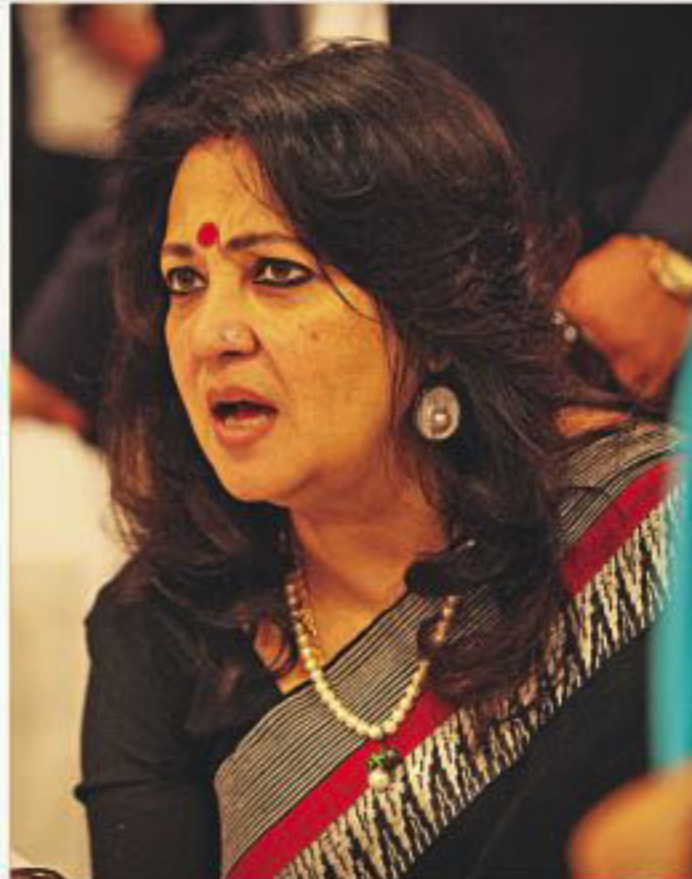
Clockwise from top, visiting Chief Minister of West Bengal Mamata Banerjee joins the artists of Dhaka and Kolkata as they sing the national anthems of Bangladesh and India at Sonargaon Hotel in the capital yesterday. Mamata's entourage includes, among others, actors Moon Moon Sen, Prosenjit Chatterjee, Deepak Adhikari Dev, and singer Nachiketa.