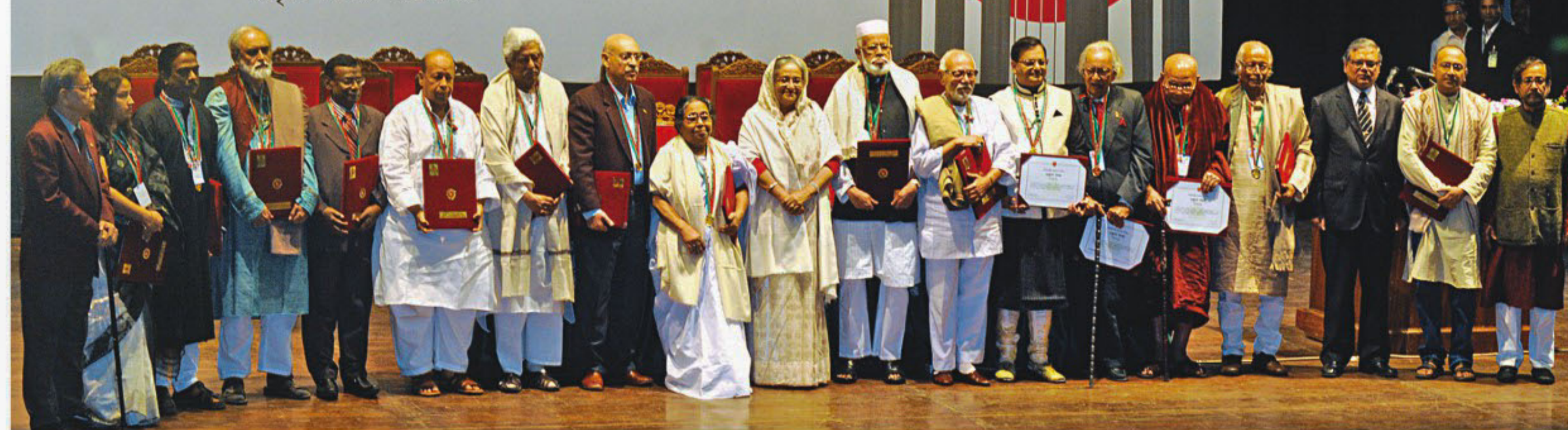
Prime Minister Sheikh Hasina on stage with the awardees of the Ekushey Padak of this year at the Osmani Memorial Auditorium in the capital yesterday. This year 15 people got the honour.