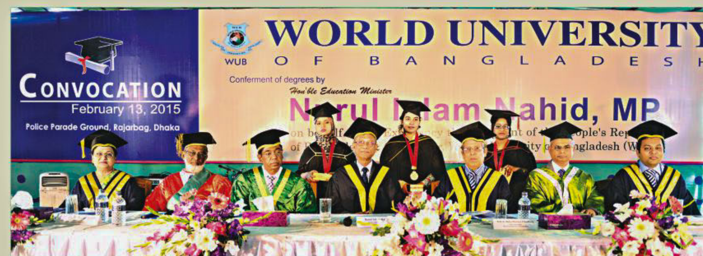
The World University of Bangladesh (WUB) hosted its 3rd Convocation at Rajarbagh Police Parade Ground on February 13, 2015. The event was chaired by Education Minister Nurul Islam Nahid.