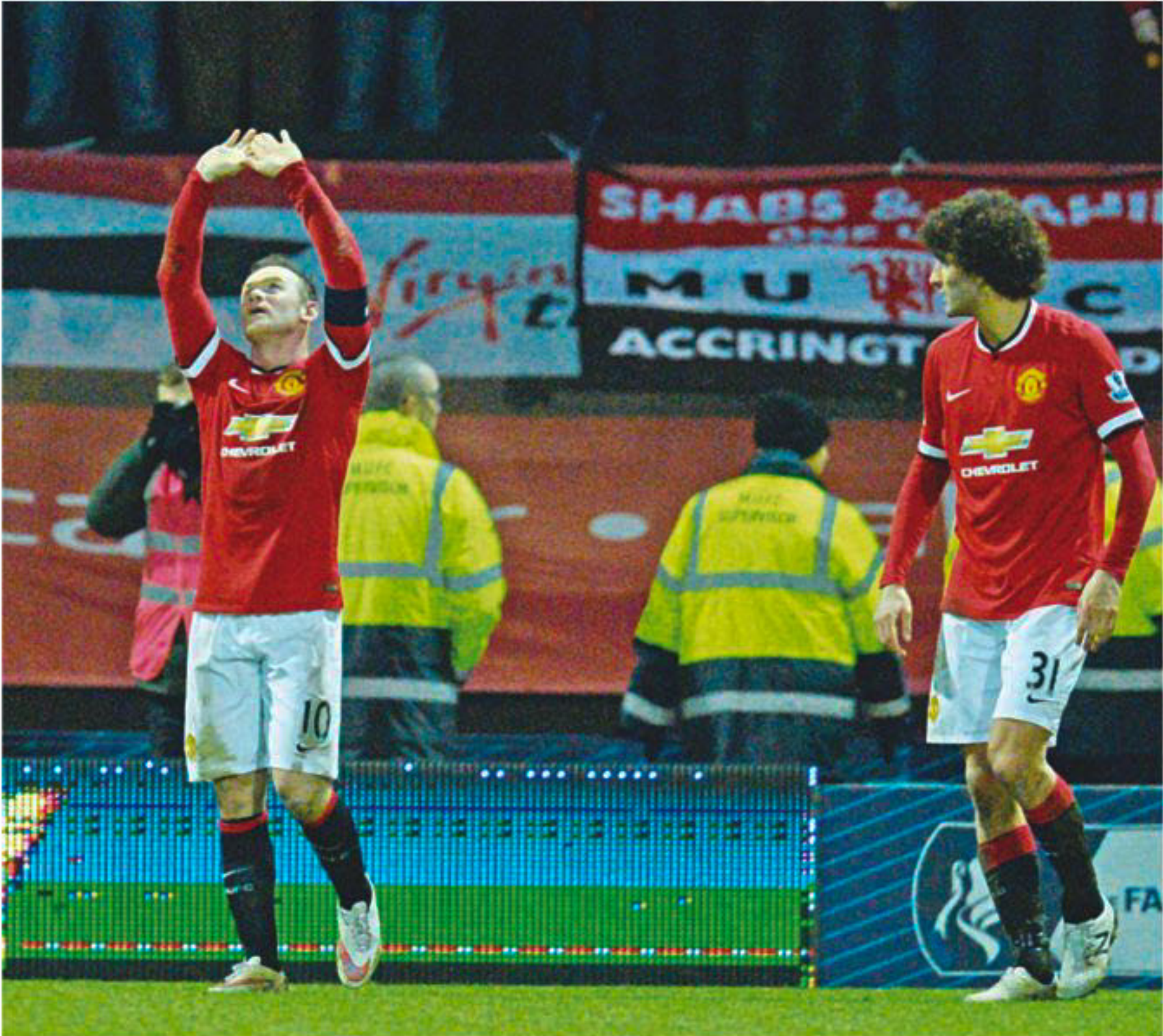
Manchester United star Wayne Rooney (L) celebrates scoring the third goal against Preston North End during their FA Cup fifth round clash at the Deepdale Stadium on Monday.

SCA has a lawsuit in Dallas state district court pursuing additional claims against Armstrong, who is also fighting a federal lawsuit over fraud claims that could cost him $100 million.