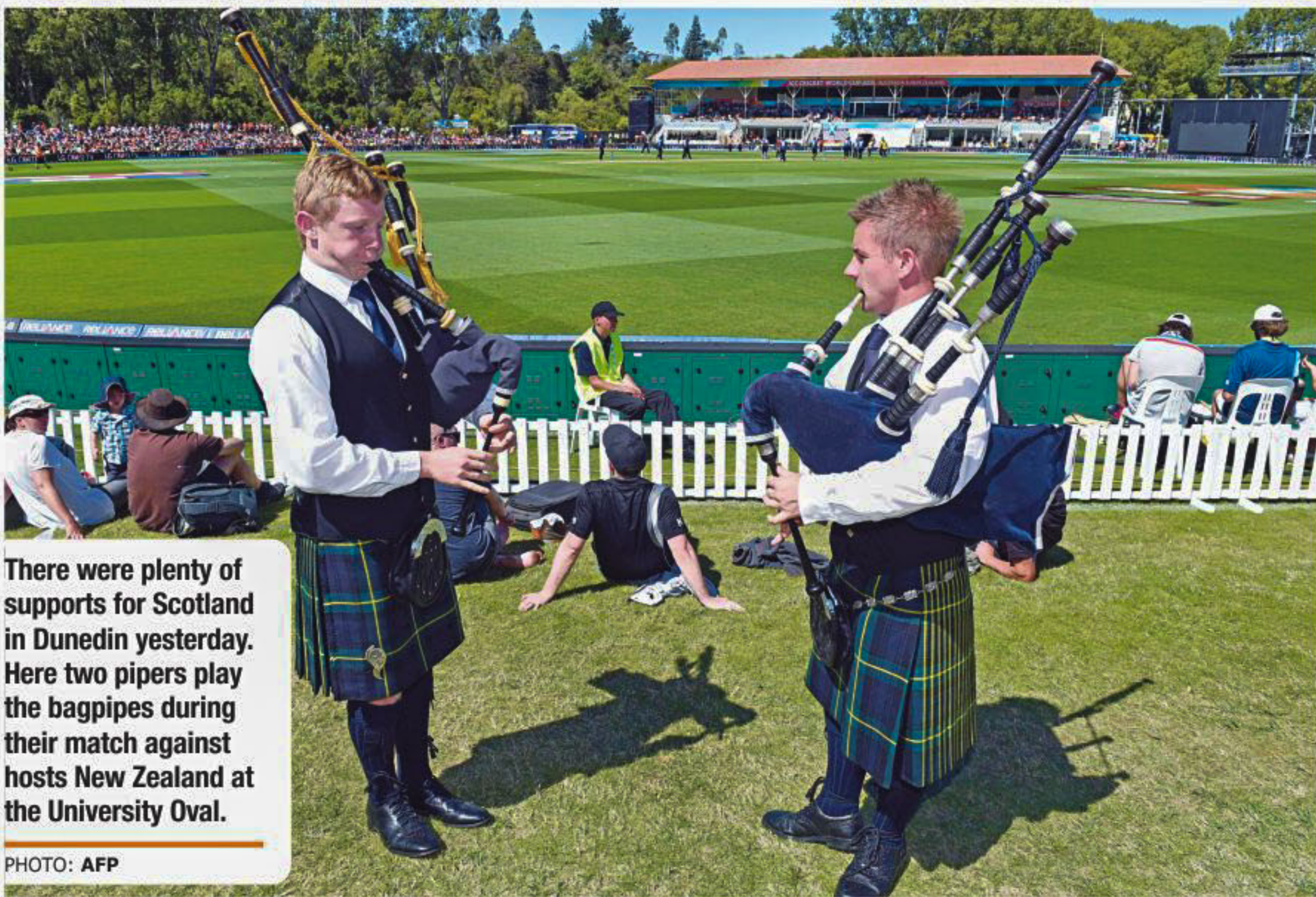
There were plenty of supports for Scotland in Dunedin yesterday. Here two pipers play the bagpipes during their match against hosts New Zealand at the University Oval.

Part of the fee was allegedly siphoned off to unknown individuals, sparking the probe into the Board of Control for Cricket in India (BCCI) of which both Srinivasan and Modi were senior members, according to local media reports Tuesday.