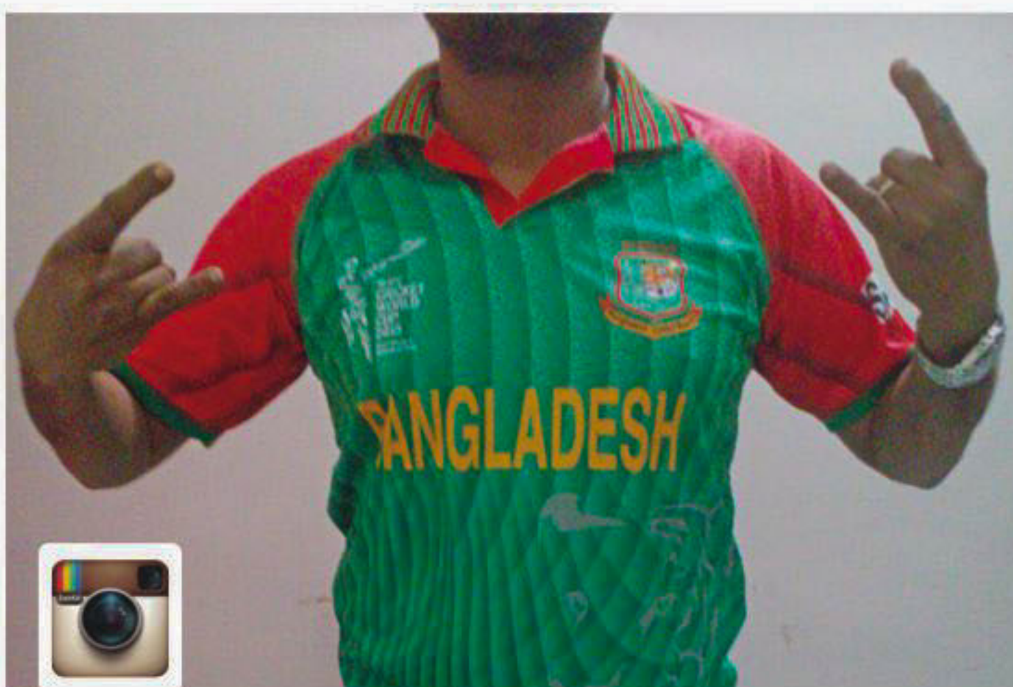
(Above) A Tigers fan is all geared up at his workplace. (R) Four young Kiwi fans and an elderly Scottish lady show their support.