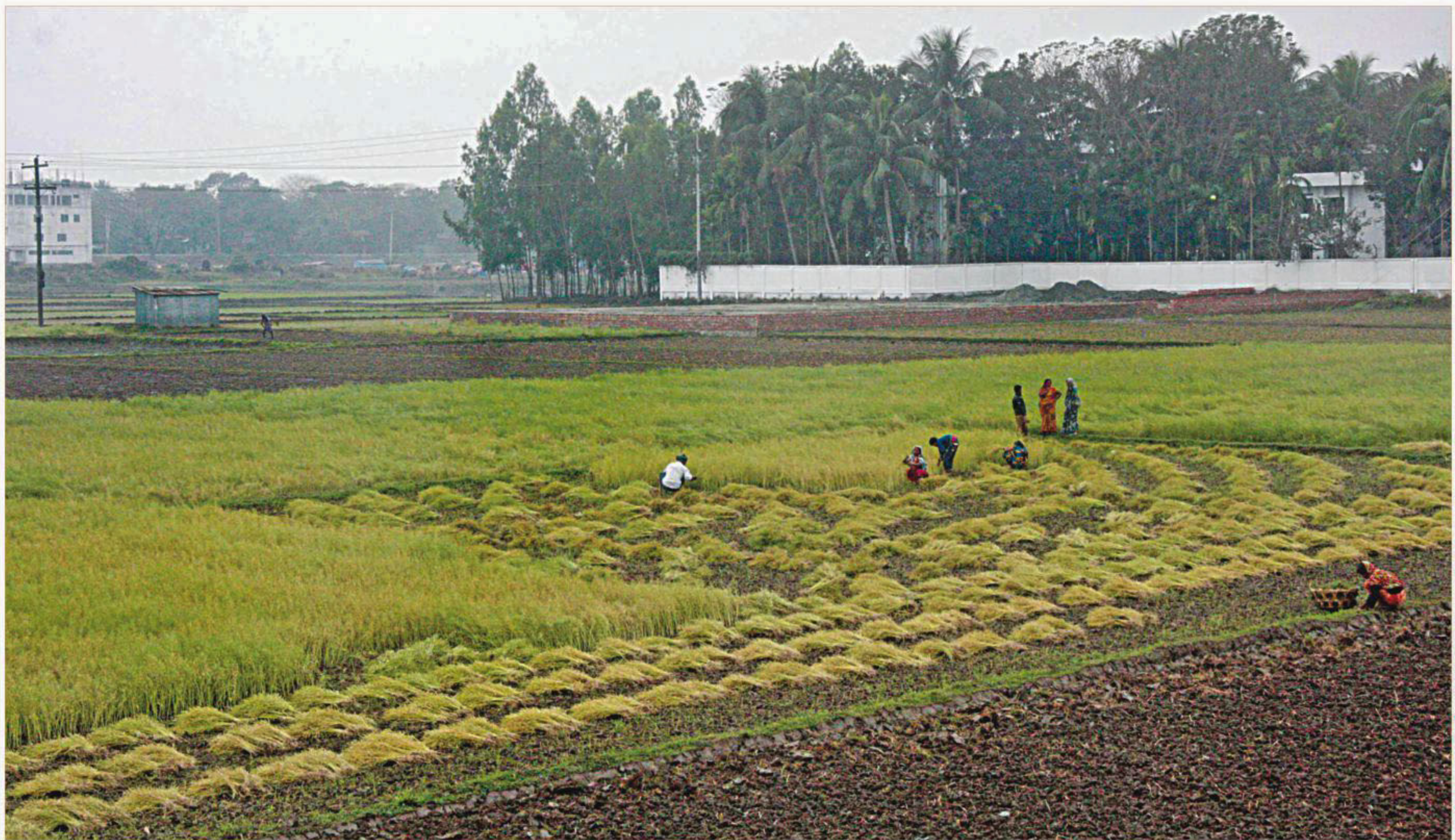
Farmers of Tangail taking home a good yield of mustard this year, thanks to favourable weather. But they are not sure whether they will be able to sell their produce in the market, amid the non-stop transport blockade. The crop has been cultivated on 39,001 hectares of land across 12 upazilas. The photo was taken in the sadar upazila.

Research Initiative Bangladesh and other will organise a workshop on "Right to Information act." Venue: Hotel Six Seasons, Gulshan-2, Time: 10:00am.