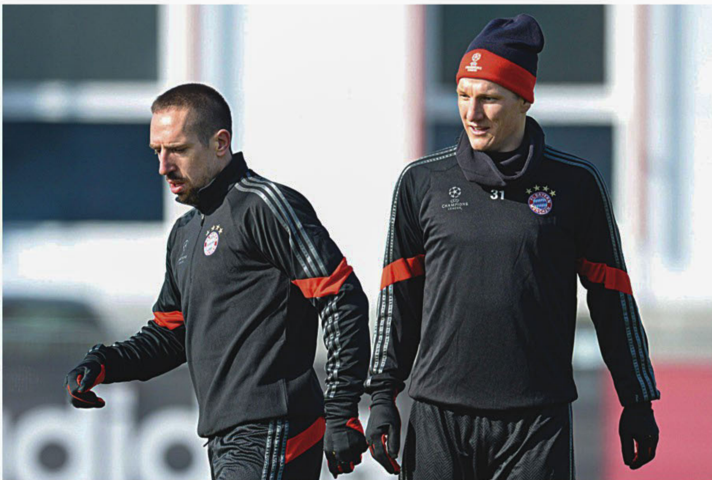
Bayern Munich stars Franck Ribery (L) and Bastian Schweinsteiger attend a training session in Munich yesterday on the eve of their Champions League match against Shakhtar Donetsk.

They posted a 7-0 away win at BATE Borisov when Brazil striker Luiz Adriano, their top scorer for the last five seasons, finished with five goals.