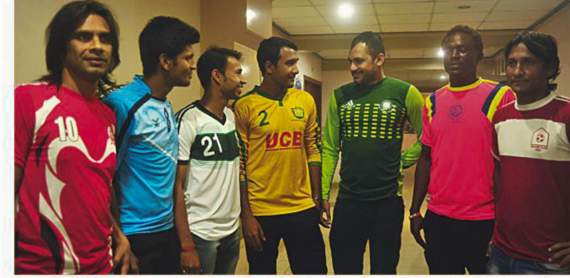
Captains of seven out of the 12 teams participating in the Federation Cup pose for a photograph at the corridor of the Bangladesh Football Federation House yesterday. The season's curtain-raising tournament kicks off at the Bangabandhu National Stadium today.

"I wanted us to keep the width on the pitch. We changed it around at half-time and it worked well for us."