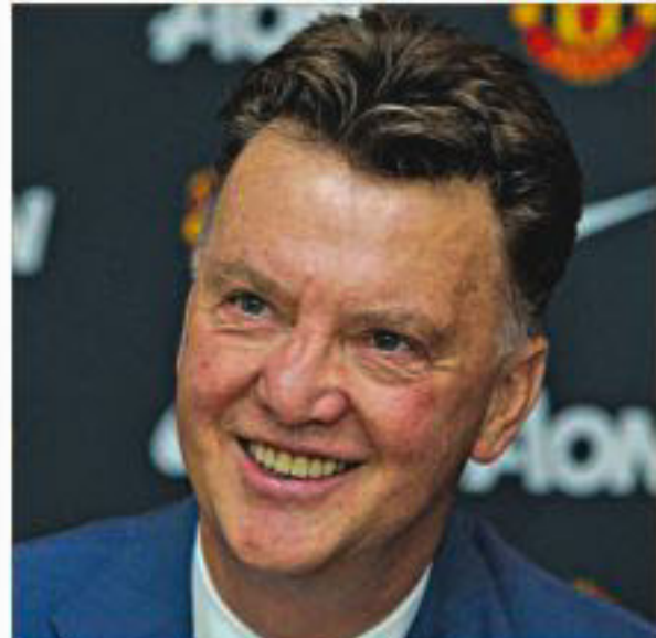
LOUIS VAN GAAL

"There's always one shock and always a hero - hopefully it's going to be a Preston North End player."