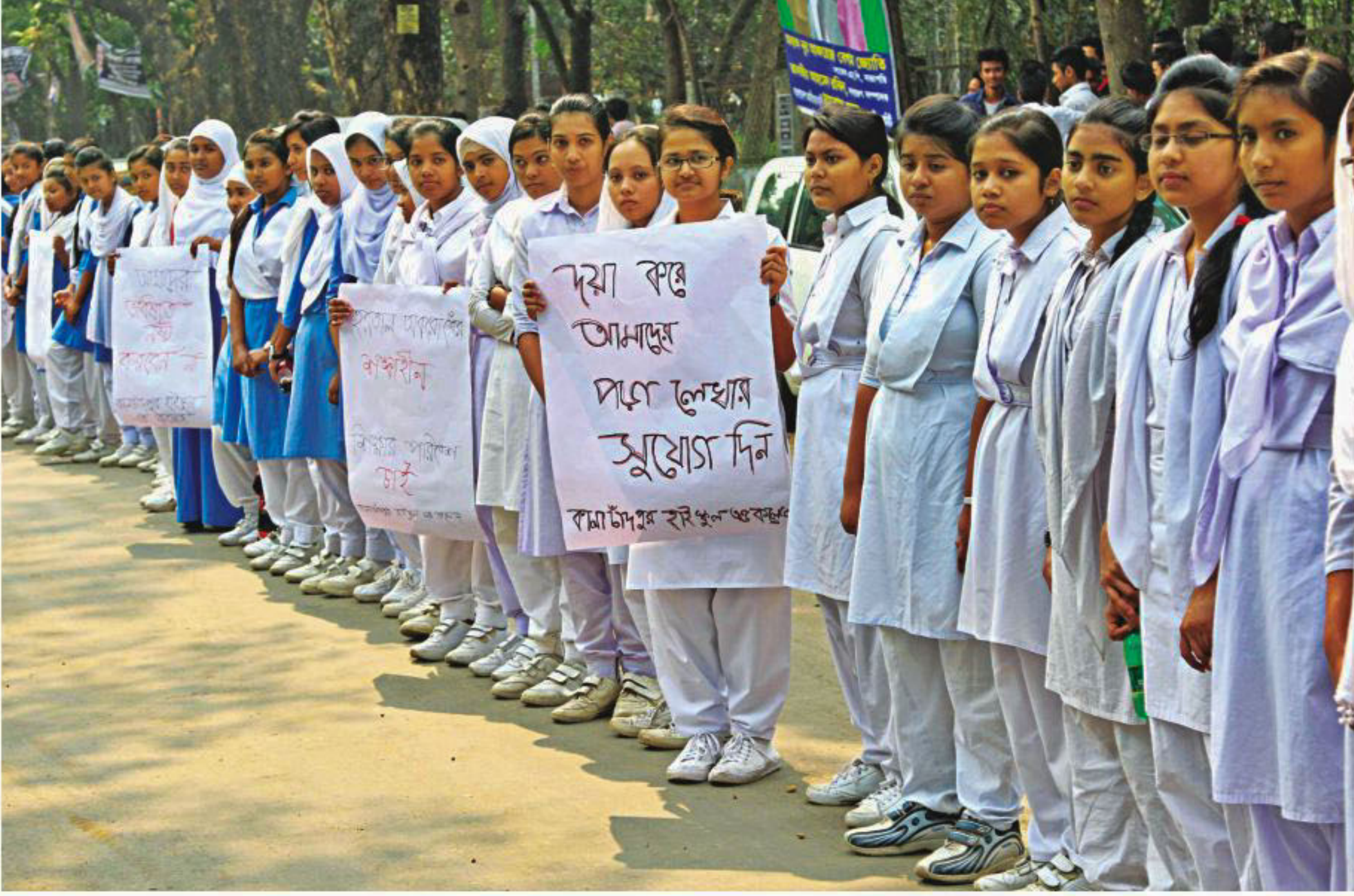
Students of Kalachandpur High School and College are "made" to form a human chain in front of the BNP chairperson's Gulshan office and demand they be allowed to study and go to school safely.