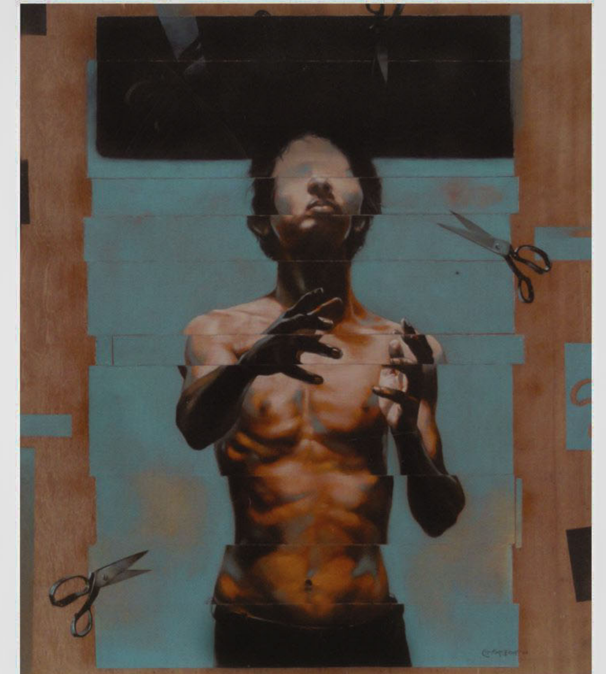
Syed Fida Hossain, Self Quest and Panorama World 1 , oil on board.