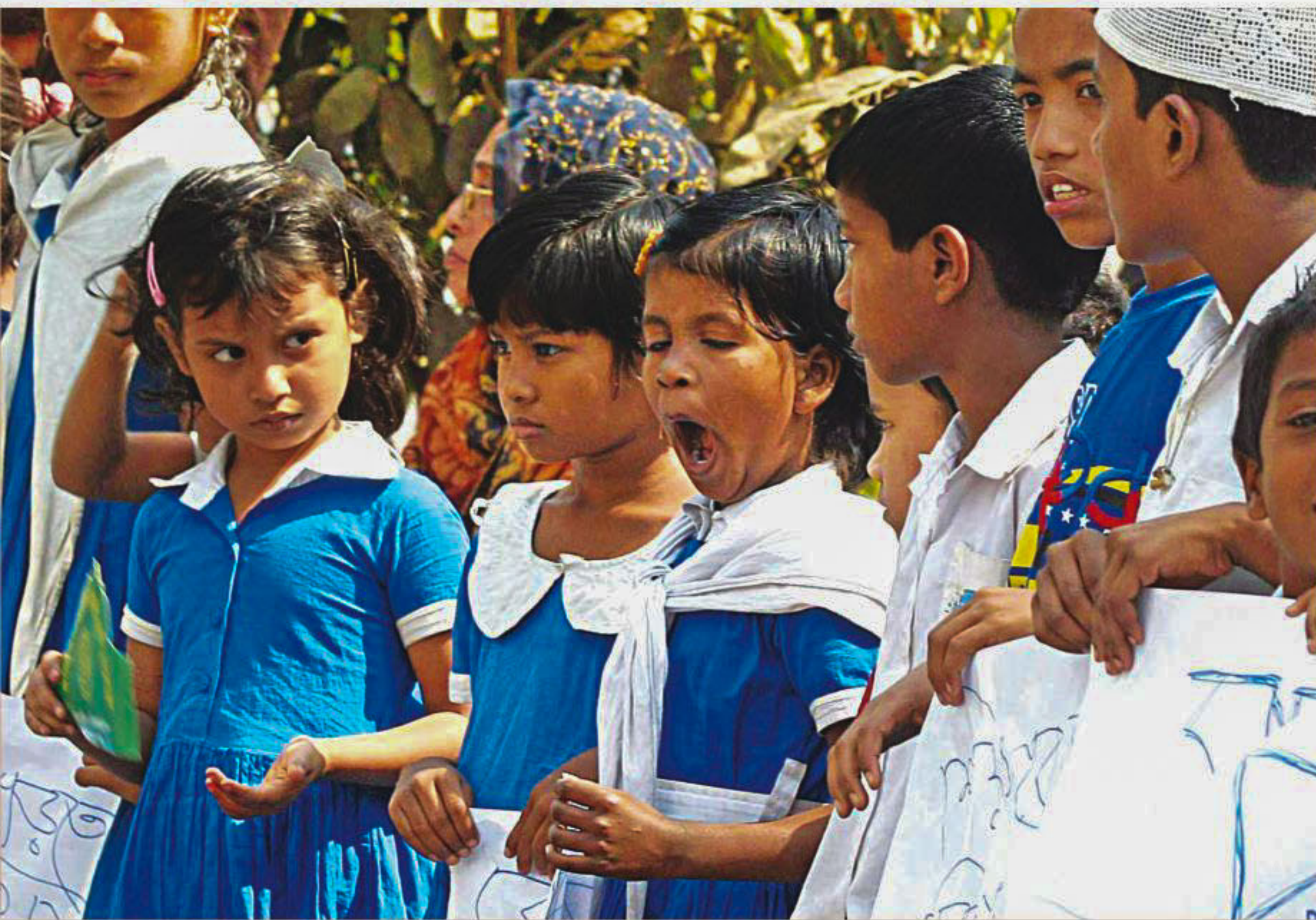
Tired of standing under the sun for more than two hours, one of the schoolchildren yawns during a human chain in the capital's Motijheel yesterday. Over one thousand students endured the heat at the event organised to protest blockade and hartals that have been hampering academic activities.