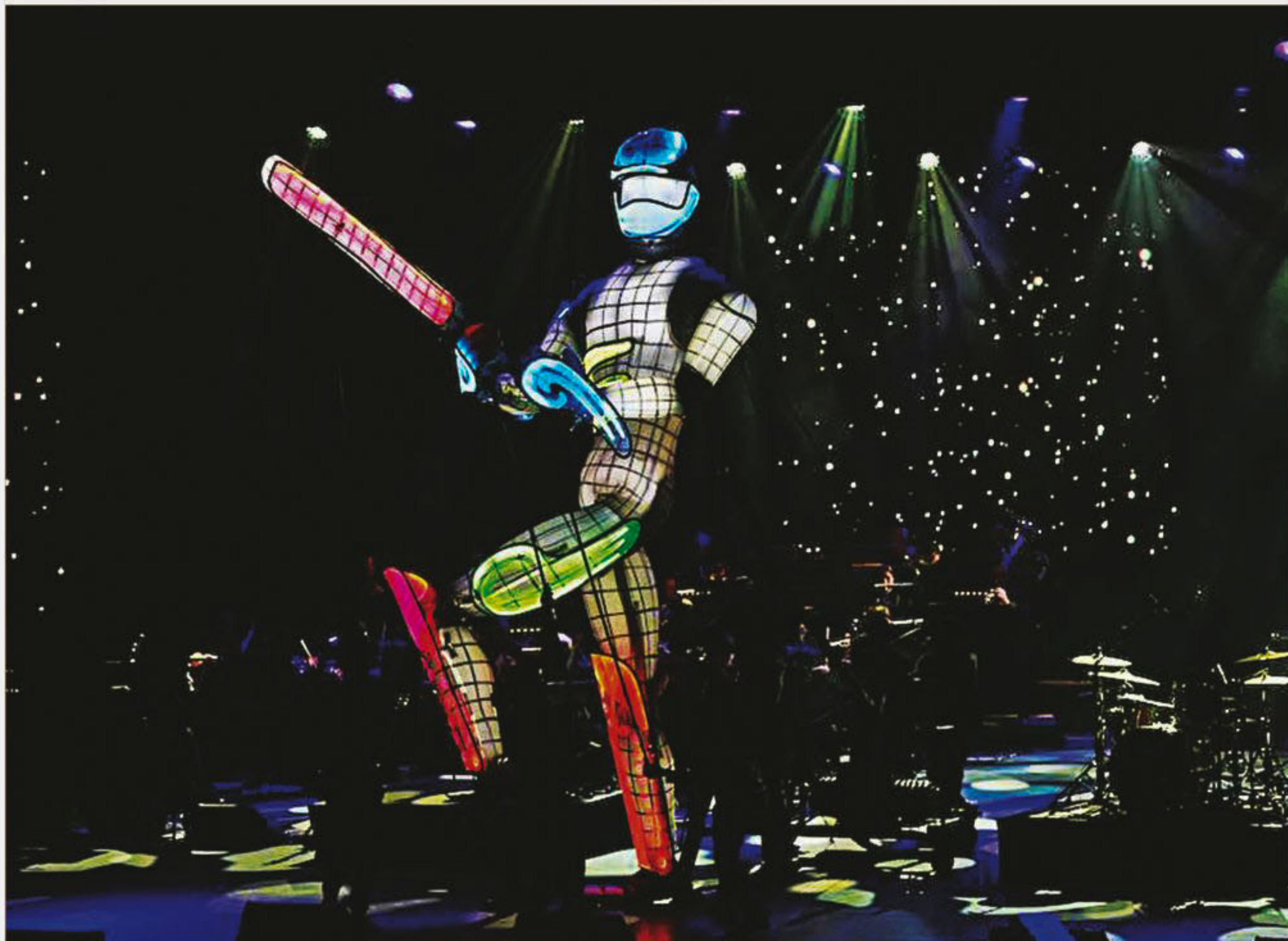
A giant puppet cricketer during the ICC Cricket World Cup 2015 opening event at the Sidney Myer Music Bowl in Melbourne yesterday.