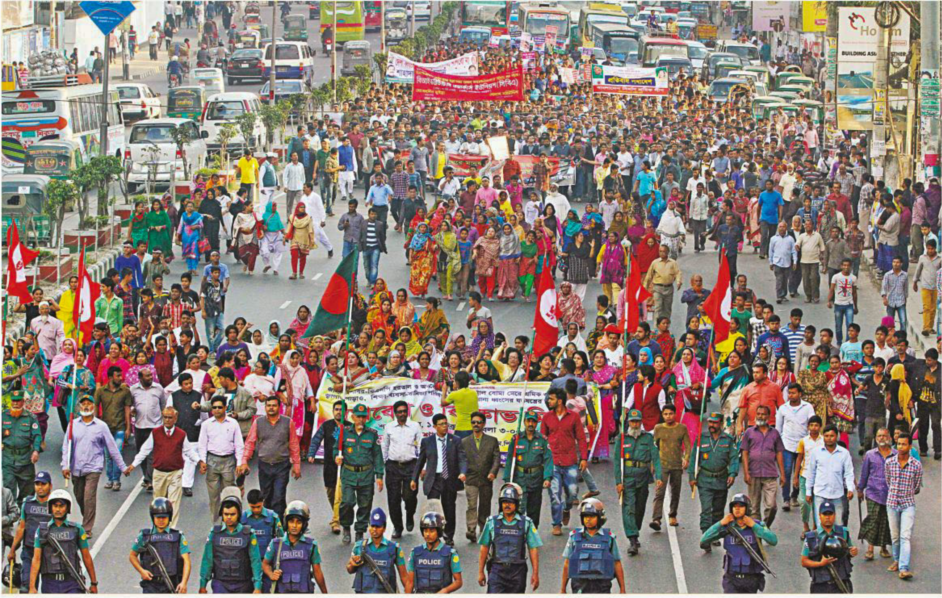
Under police protection, a procession of pro-ruling party workers, employees and professionals led by Shipping Minister Shajahan Khan march the Kazi Nazrul Islam Avenue yesterday protesting the ongoing blockade and hartals. The procession left a huge tailback that lasted for hours to clear.