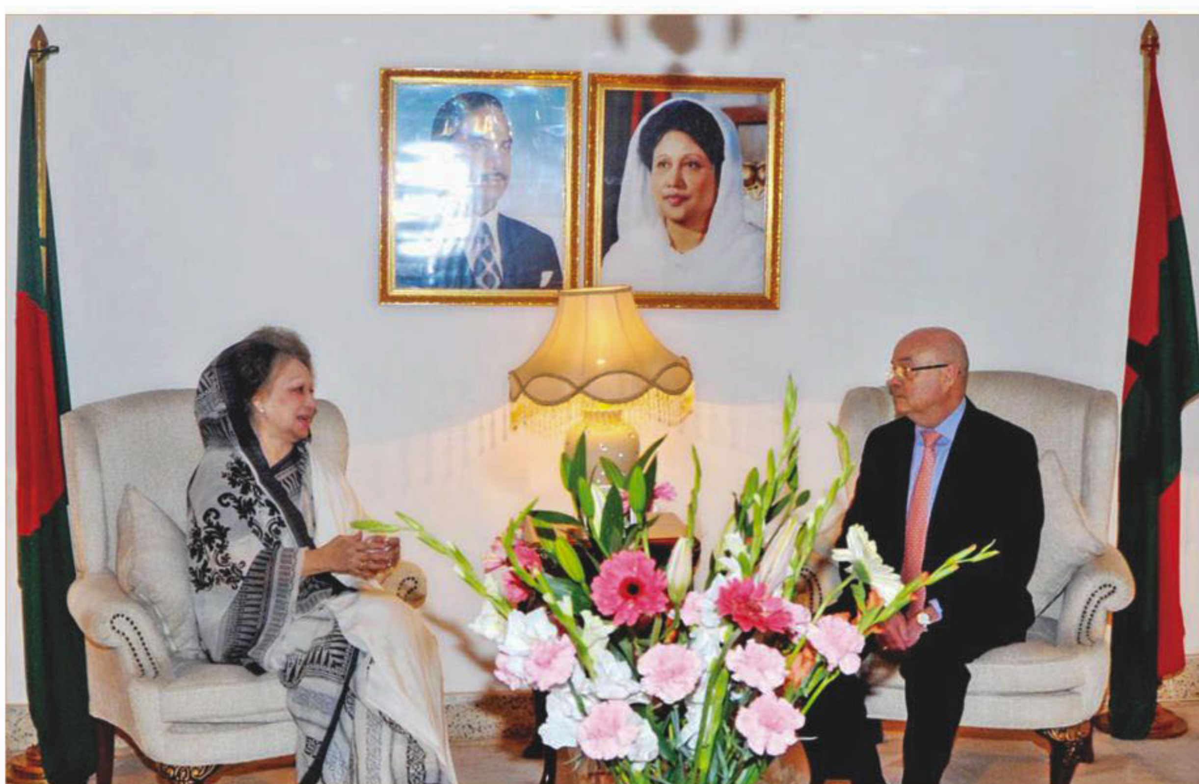
British High Commissioner in Dhaka Robert Gibson talks to BNP Chairperson Khaleda Zia at her Gulshan office in the capital yesterday.

This year Shilpakala Academy's initiative to hold theatre and street plays every evening at the Muktomancho inside Suhrawardy Udyan, only about 20 yards from the fair boundary, is an added attraction.