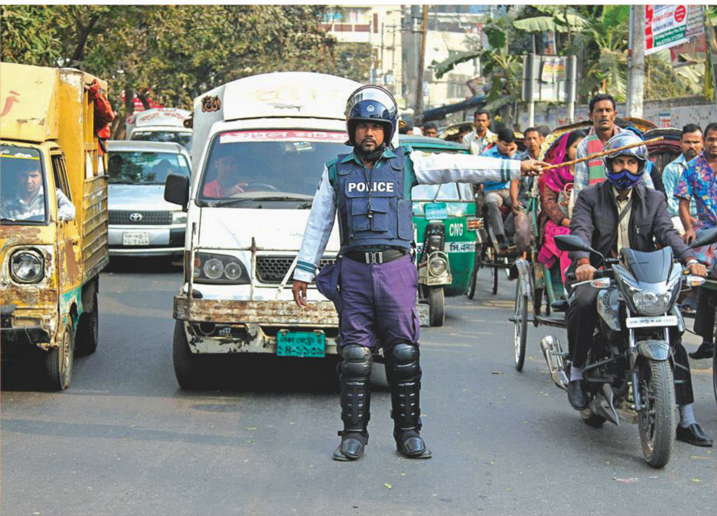
A traffic official on duty at the capital's Shajahanpur intersection yesterday, wearing some protection gears as there is no let-up in violence on the streets amid the nationwide blockade.