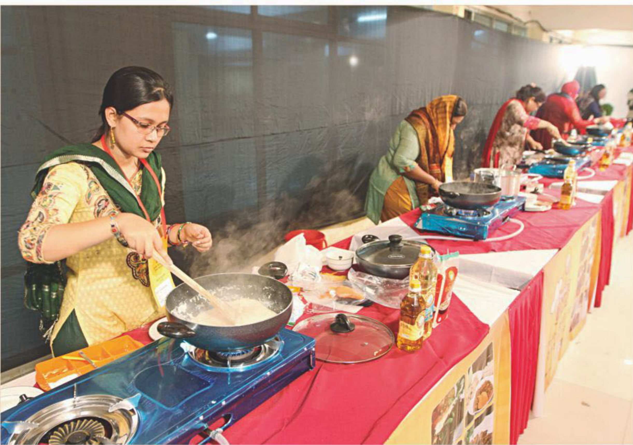
Participants battle it out in the 30-minute cook-off in the Dhaka auditions of the Rupchanda-Daily Star Super Chef 2015 held at Gulshan Shooting Club yesterday.