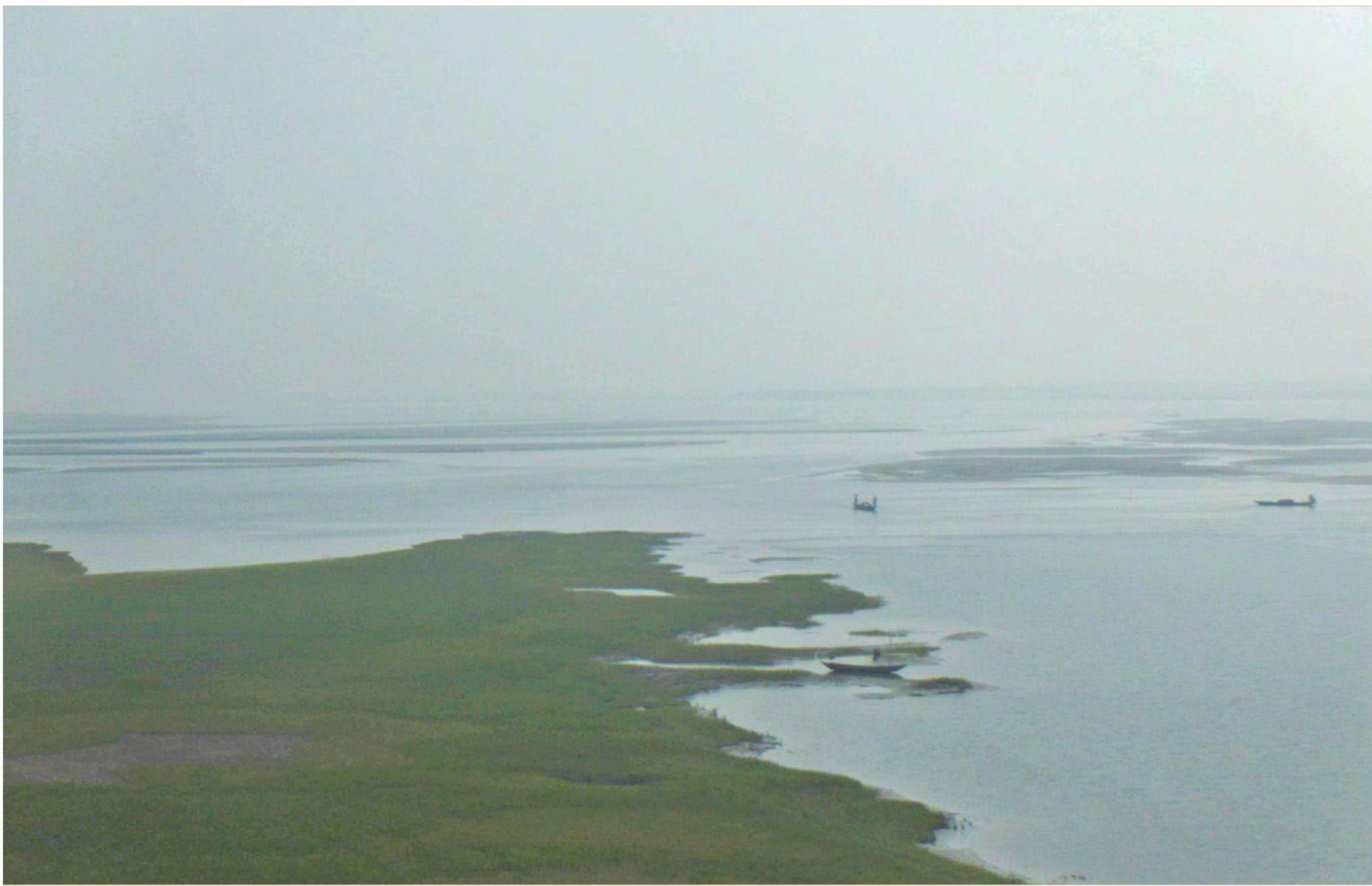
The ever-shifting Jamuna is fast losing navigability at many points, including at Bangabandhu Bridge, but there has been no serious initiative from the government to restore the river to its previous state. The photo was taken on February 4.