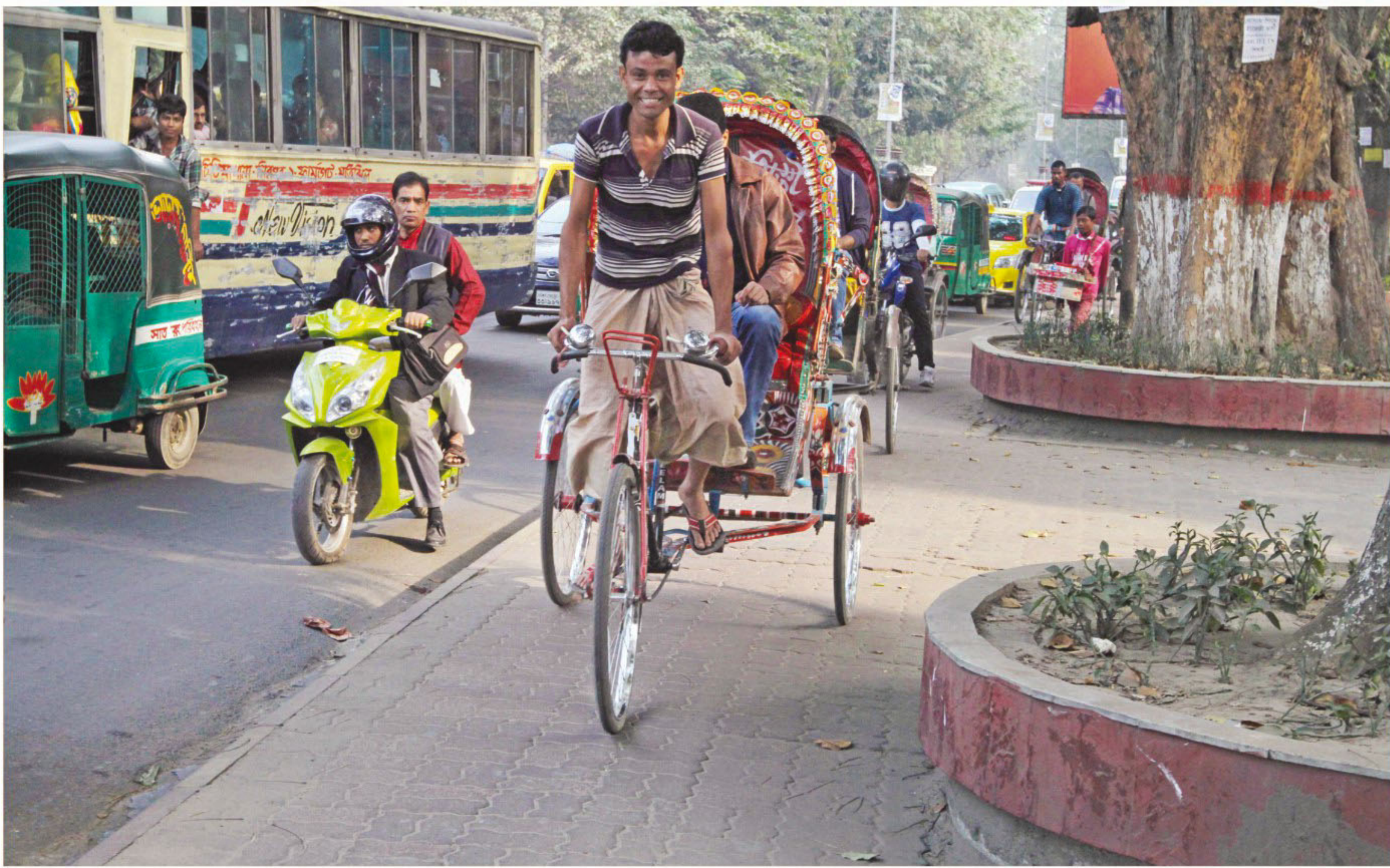
Unwilling to wait till the lights turn green, rickshaws follow a trend set by motorcyclists, taking to the footpaths by Ramna Park in the capital on Saturday.

Under the 2011-12 academic session, 78 disqualified students were admitted after they were given one mark as grace.