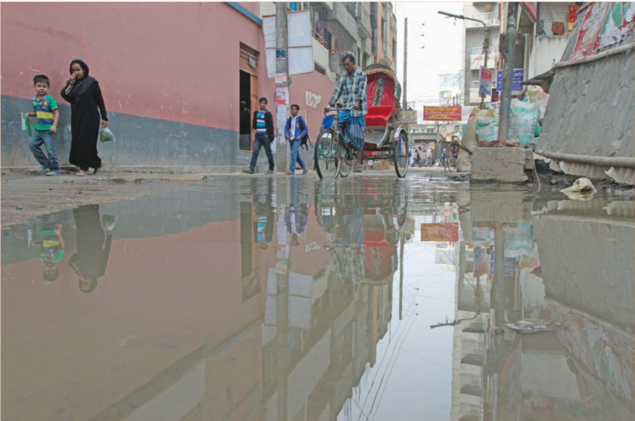
It was not only yesterday but for, as per the locals, over one whole year that sewage has been leaking out onto the streets from blocked underground pipes in Ahmedbagh-Mayakanon area of the capital while the stench spreading even further. The photo was taken on Saturday.