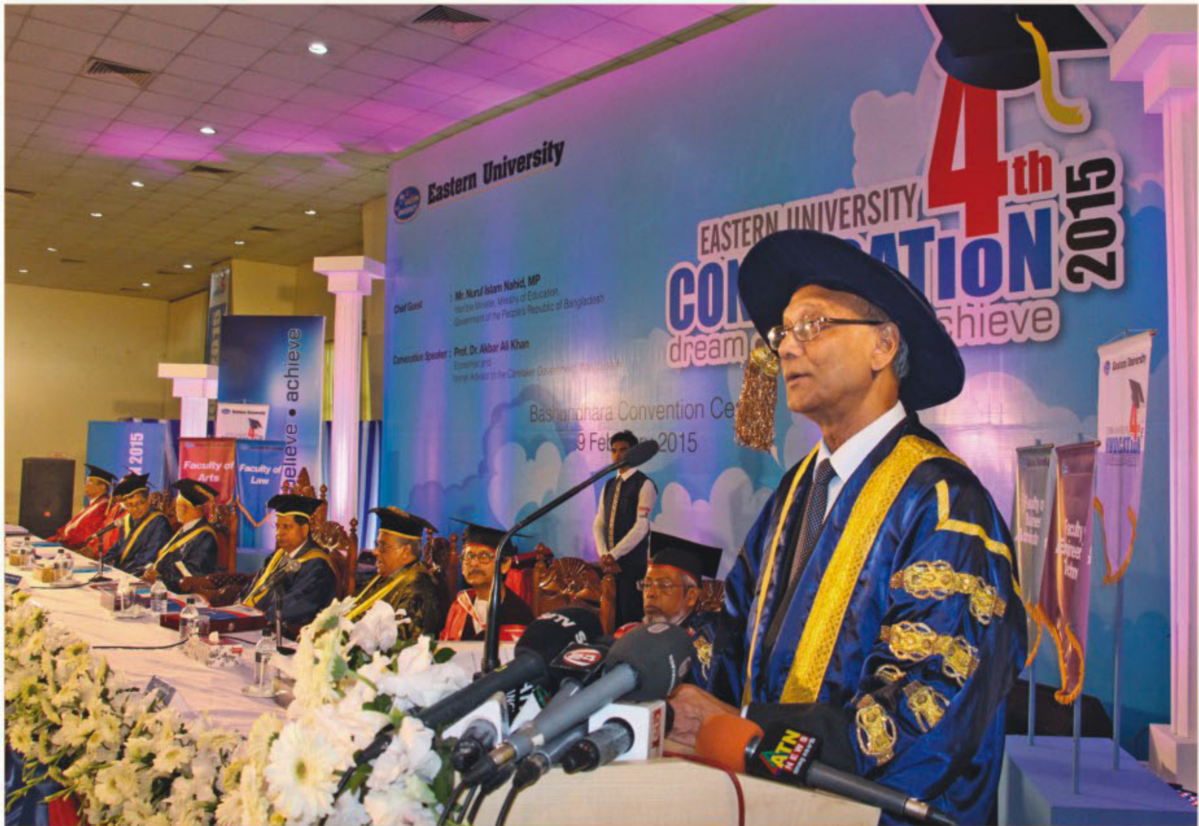
Education Minister Nurul Islam Nahid addresses Eastern University Convocation-2015 at Bashundhara Convention Centre in the capital yesterday.

"We will look into the problem and try to come up with a solution," he added.