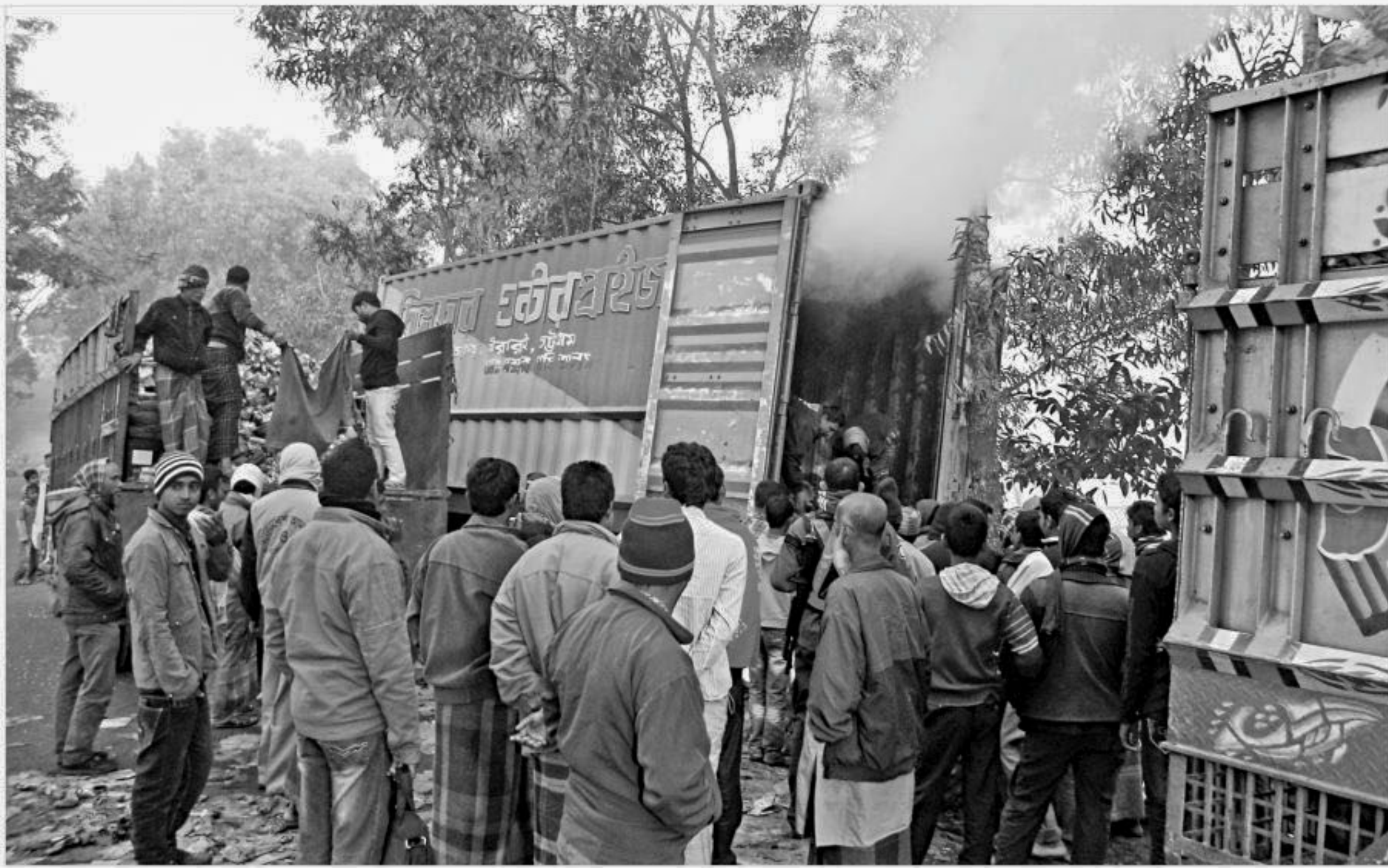
Smoke rises out of a truck laden with boxes of biscuit packets after it was petrol-bombed in Amtoli area on the Dhaka-Dinajpur highway early yesterday.