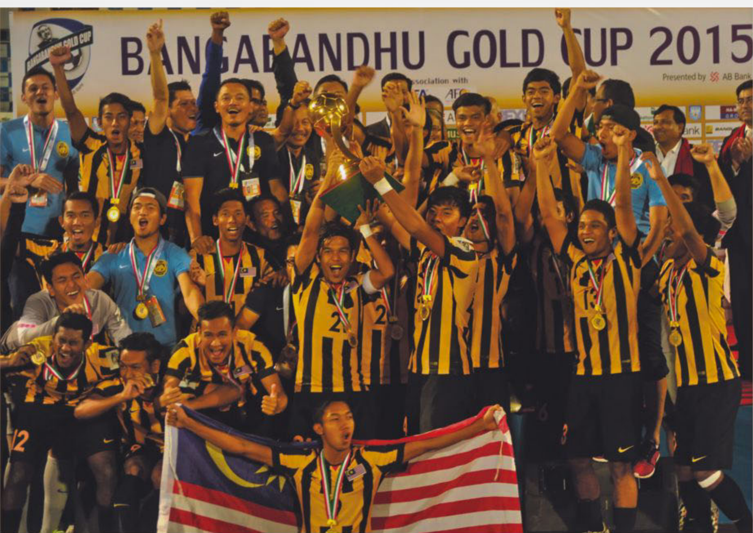
The Class of 2015: Members of the Malaysian football team celebrate their finest moment with the Bangabandhu Gold Cup. They won the trophy defeating hosts Bangladesh 3-2 in a pulsating final at the Bangabandhu National Stadium last night. Story on Page 14