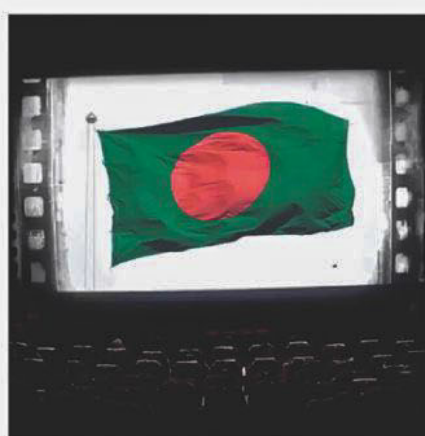
When the National Anthem was playing