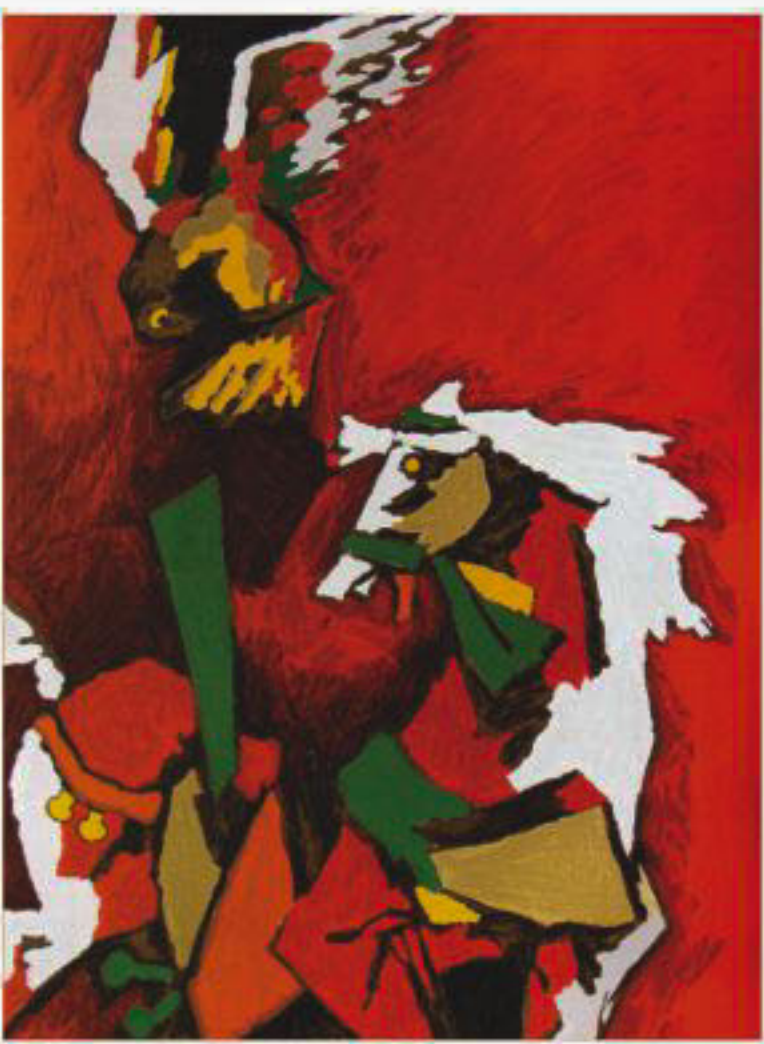
"Horses" -- MF Husain

Meanwhile, young Indian painters Chitra Ganesh and Dhruvi Acharya undertook collaborative painting on site. Starting with a blank canvas that transformed into a finished composition over four days, they raised questions about