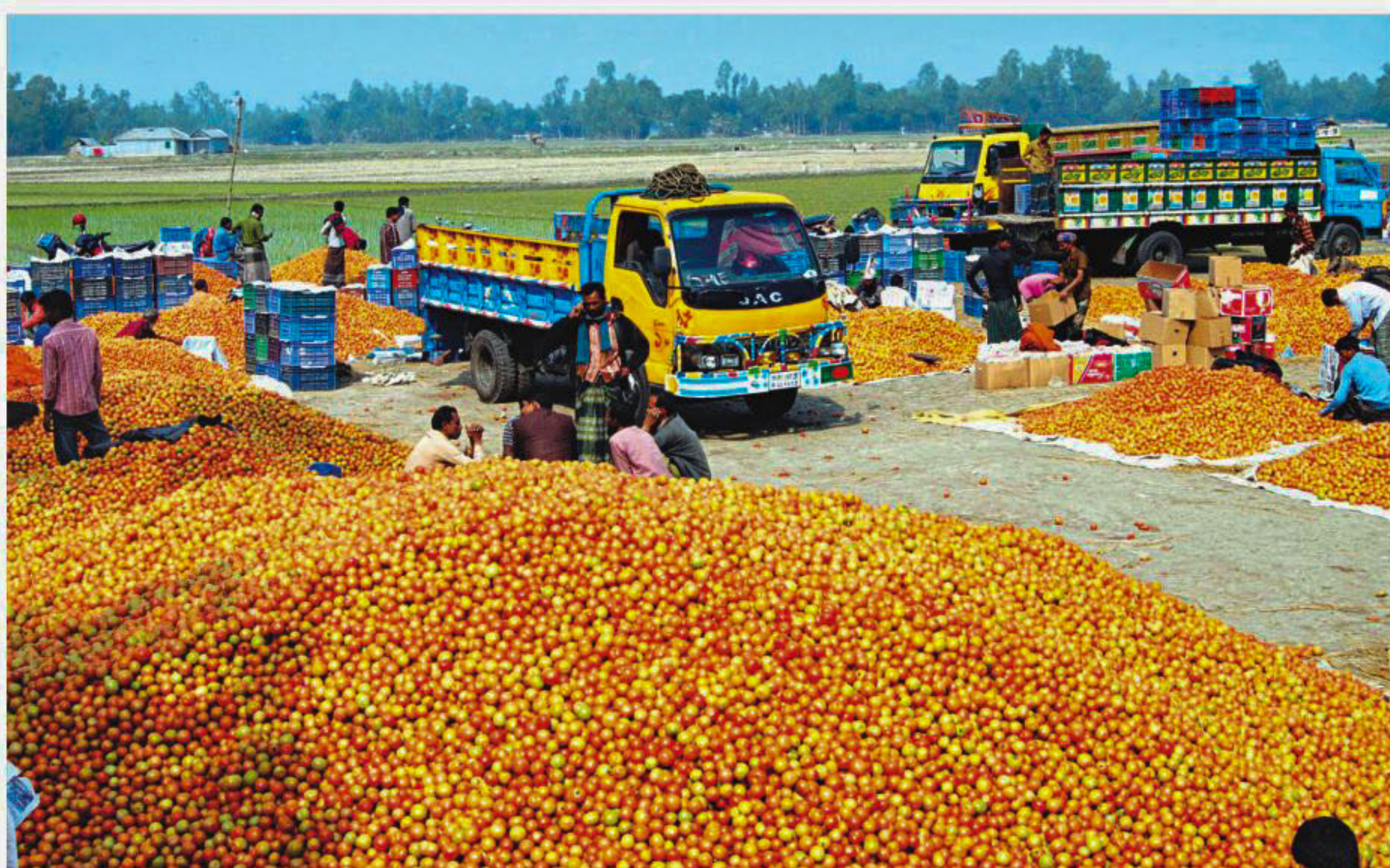
Tomato farmers got a great harvest this year but are being let down by poor prices. Wholesalers are reluctant to buy the perishable vegetables fearing they would not be able to ship during the ongoing blockade. The photo was taken at Chowkibari of Dhunat in Bogra.