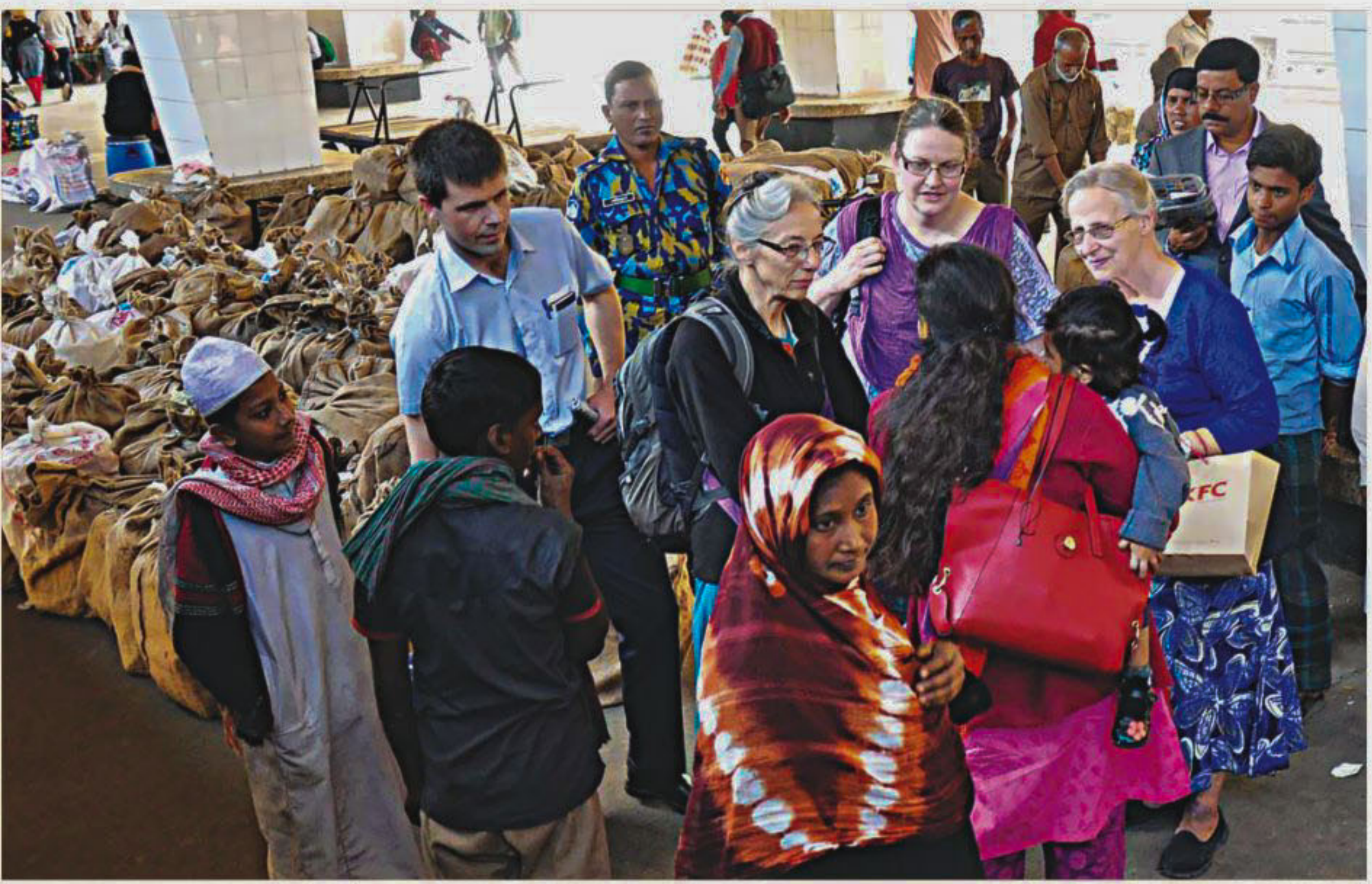
Passengers, including foreign tourists, wait for train at Kamalapur Railway Station in the capital amid rail schedule disruption yesterday during hartal and blockade enforced by the BNP-led opposition combine. Sabotage at Mirsarai also hampered rail communications between Chittagong and other parts of the country.