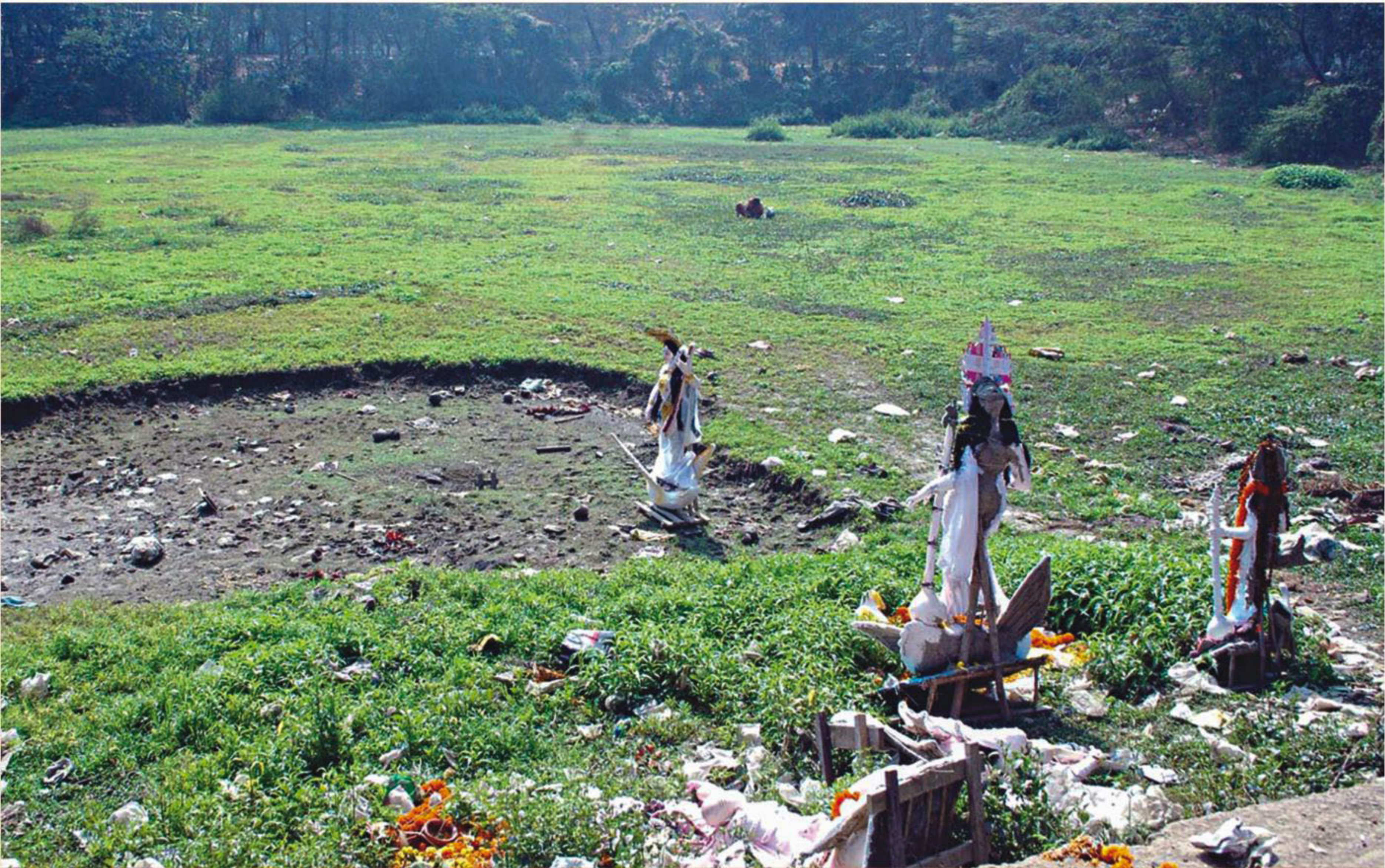
What once used to be a pond at Ramna Kali Mandir in the capital is now a stretch of uneven land used to discard objects past their expected service. Digging it up for fish farming and surrounding it with trees could be one way of revitalising the area. The photo was taken yesterday.

COP BRUTALITY ON NEW AGE JOURNO ASI closed No step against main accused SI; ADC claims probe is on against him, other alleged accomplices STAFF CORRESPONDENT