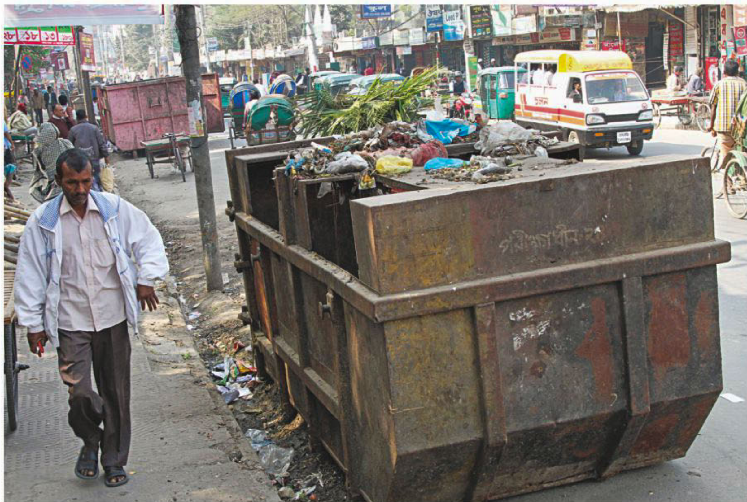
One of the two dumpsters placed on Jakir Hossain Road in the capital's Mohammadpur, the malodour being a nuisance for the neighbouring residents and the road narrowed down increasing the traffic congestion. The photo was taken recently.