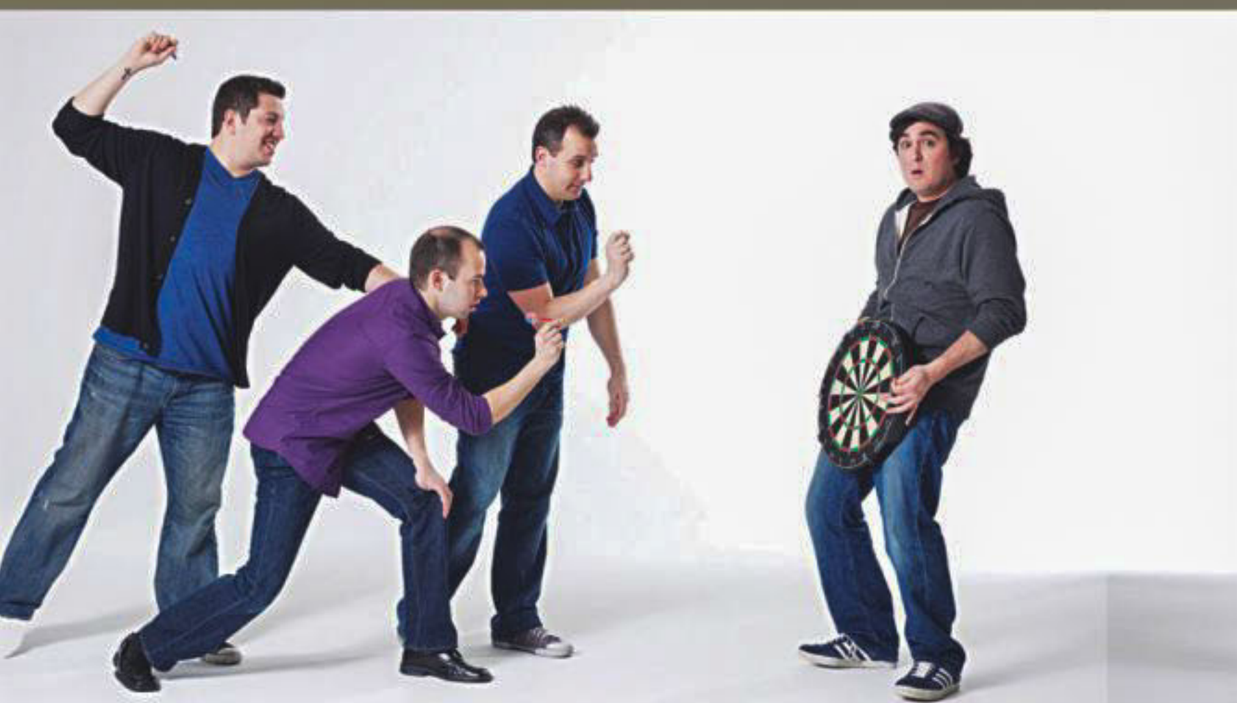
FIND FIVE DIFFERENCES BETWEEN THE TWO PICTURES FROM "I. J."

Send "ALL FOUR" answers to showbiz.tds@gmail.com Winners will receive QUEEN SPA ROOM GIFT VOUCHER courtesy of Queen Bella ALL 4 QUESTIONS MUST BE ANSWERED CORRECTLY