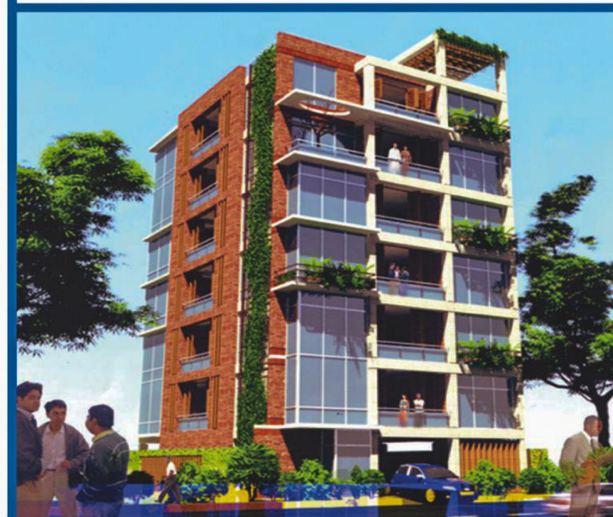
Purba Dakhina | 2150 sq-ft Mirpur DOHS, Dhaka | 4 Bedrooms with bath