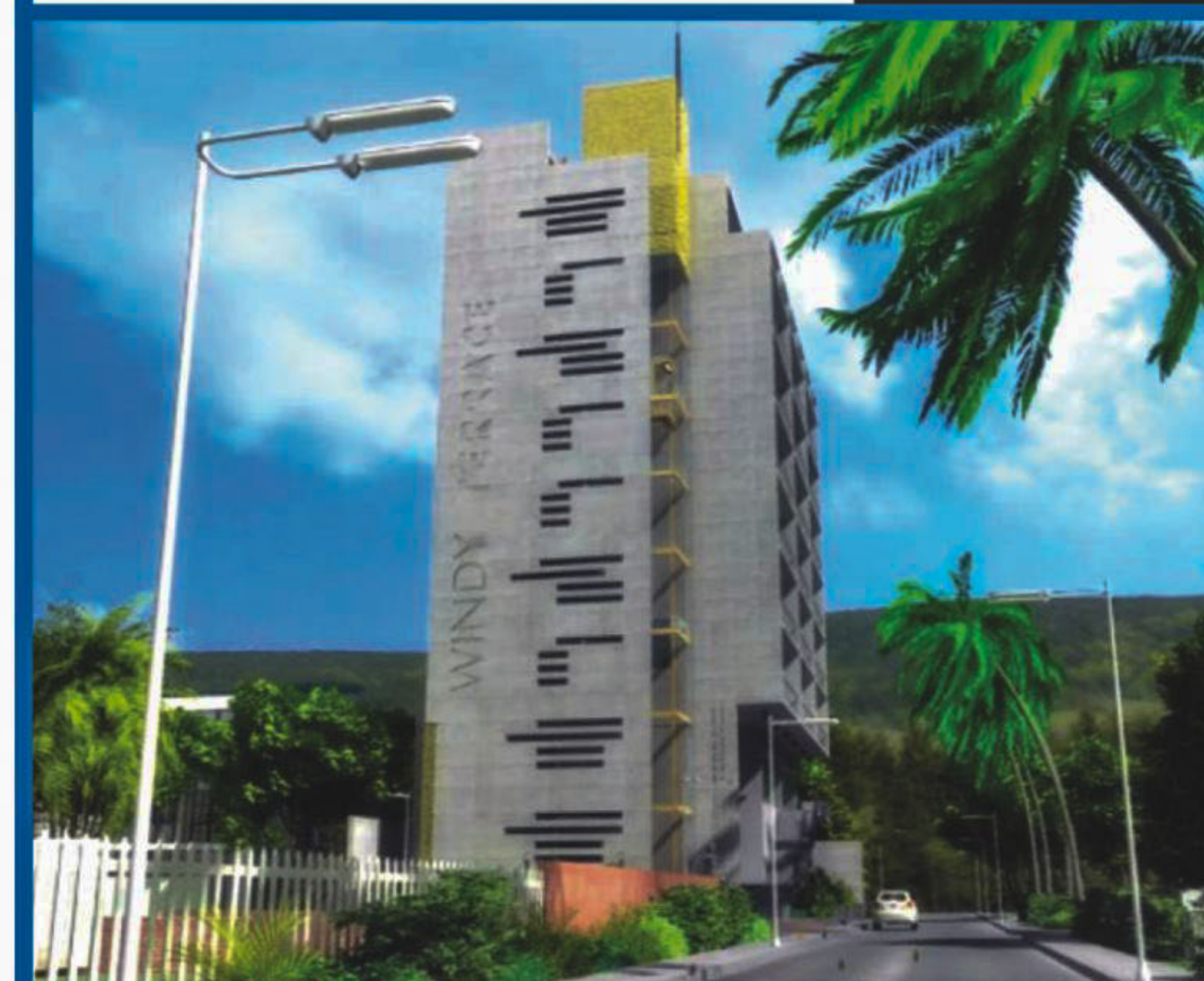
Windy Terrace | 50 (Fifty) Kolatali, Cox's Bazar | Service Apartment & Rooms