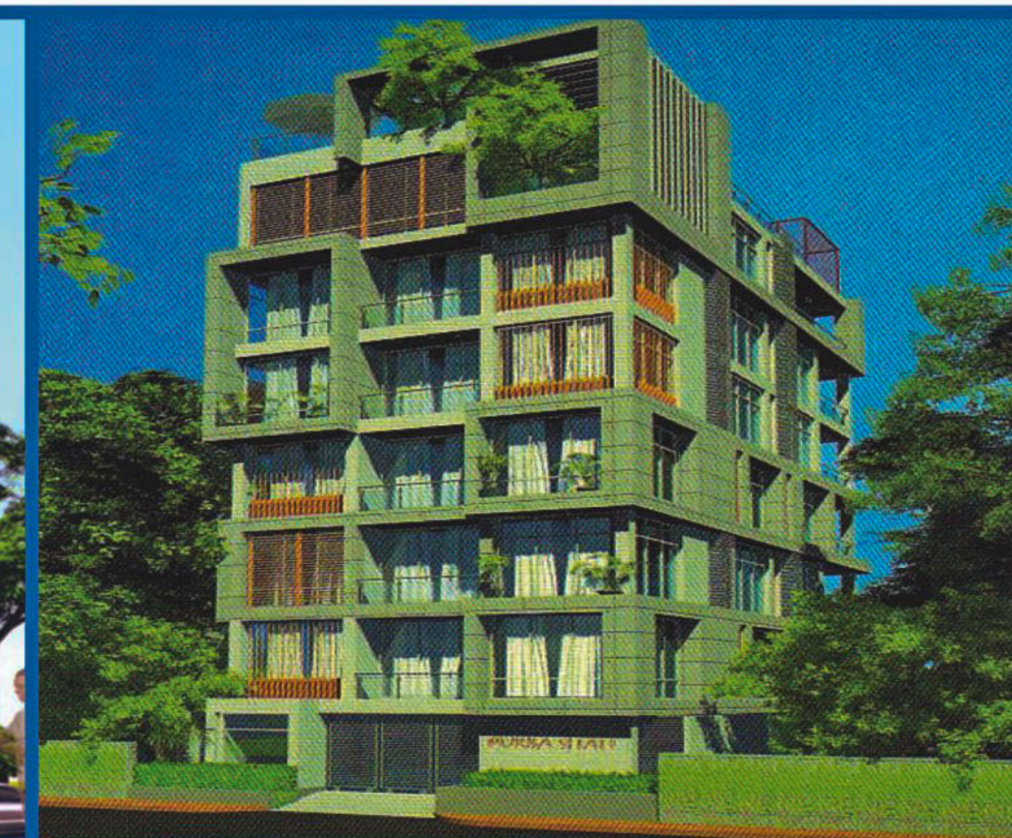
Purba Shafi | 2150 sq-ft Mirpur DOHS, Dhaka | 3 Bedrooms with bath