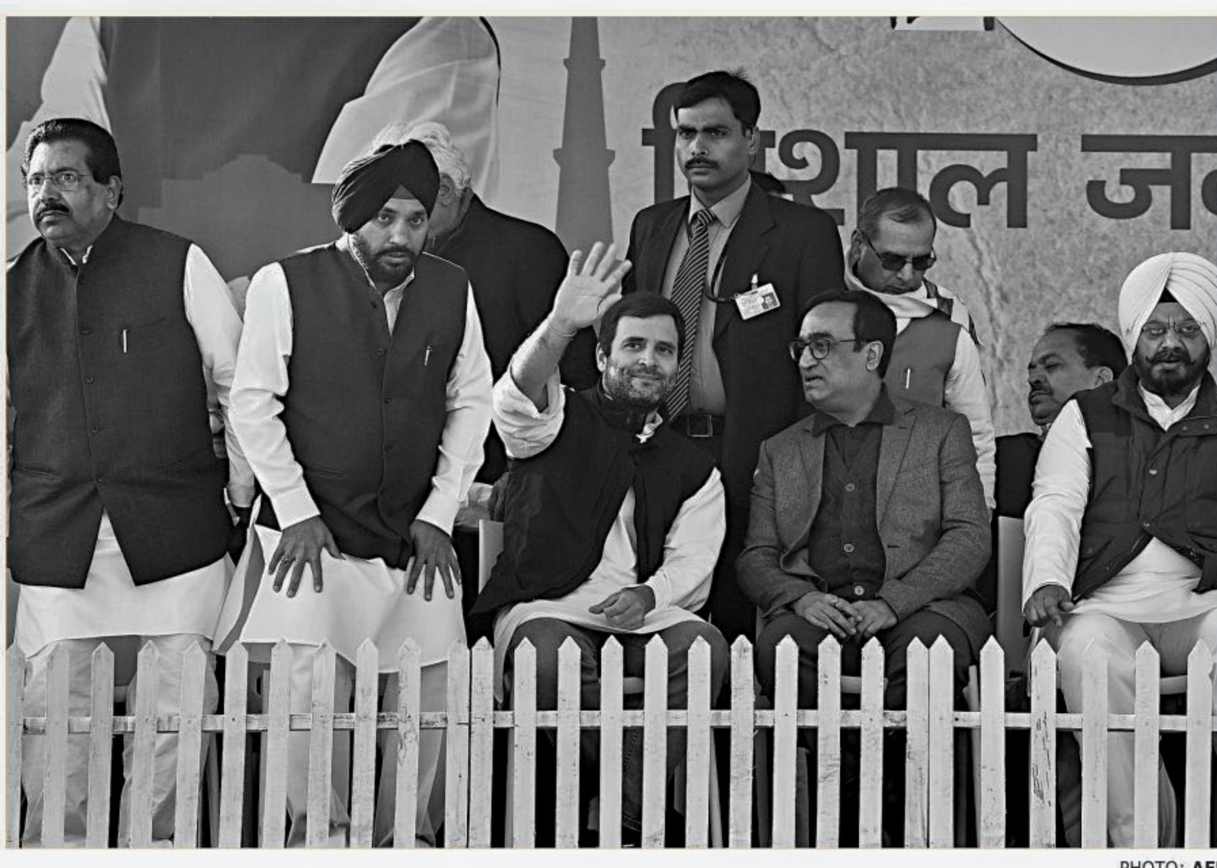
Congress vice President Rahul Gandhi (C) waves to supporters during an election rally ahead of the Delhi Assembly elections, in New Delhi yesterday. Polling will be held on February 7 with counting two days later.

North Korea restarting nuke reactor BBC ONLINE North Korea may be trying to restart a nuclear reactor which can produce fuel for a nuclear bomb, an American think tank has said. The US-Korea Institute said on its 38 North website that satellite images showed steam coming from the Yongbyon plant and an increase in melted snow.