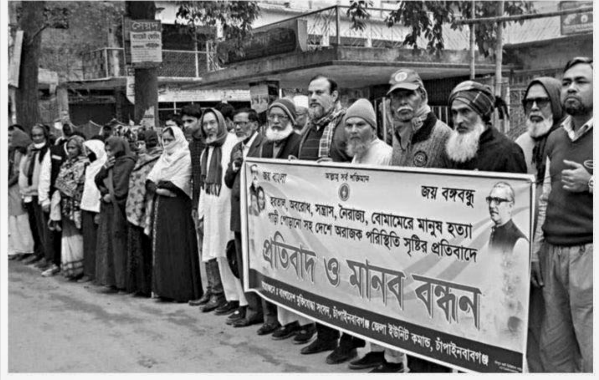
NO TO VIOLENT POLITICS: People join a human chain jointly organised by different professional bodies in front of Shaheed Satu Hall in Chapainawabganj town yesterday protesting violence including arson attack and killing in the name of blockade and hartal across the country.

Police are raiding different areas to arrest the killers, the OC added.