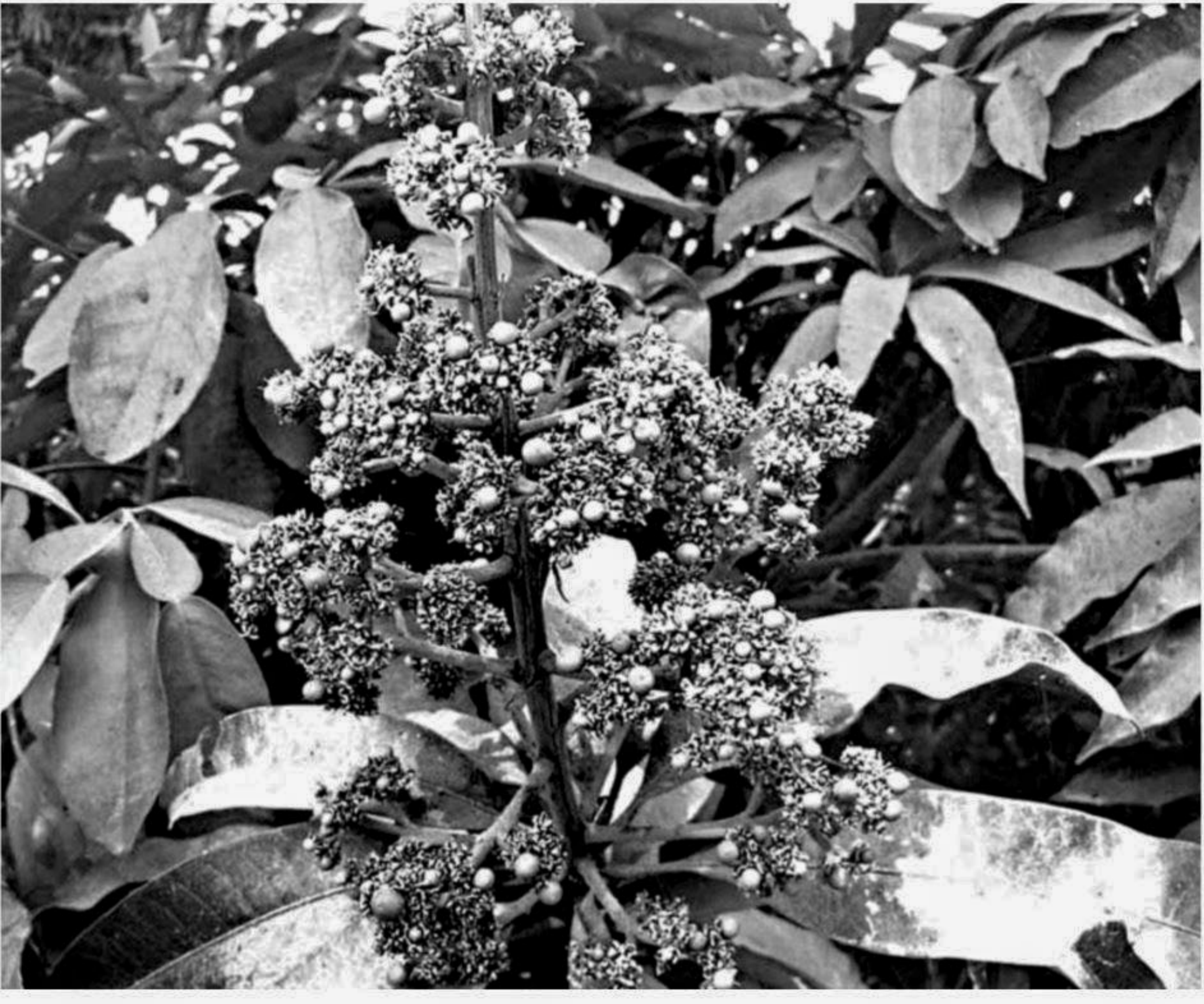
A blooming mango tree at Pathak Shikar village in Pirgachha upazila under Rangpur district starts bearing the fruit, as if heralding the advent of spring.

Police sent the girl Khagrachhari Adhunik Sadar Hospital for medical test on the day, said the OC.