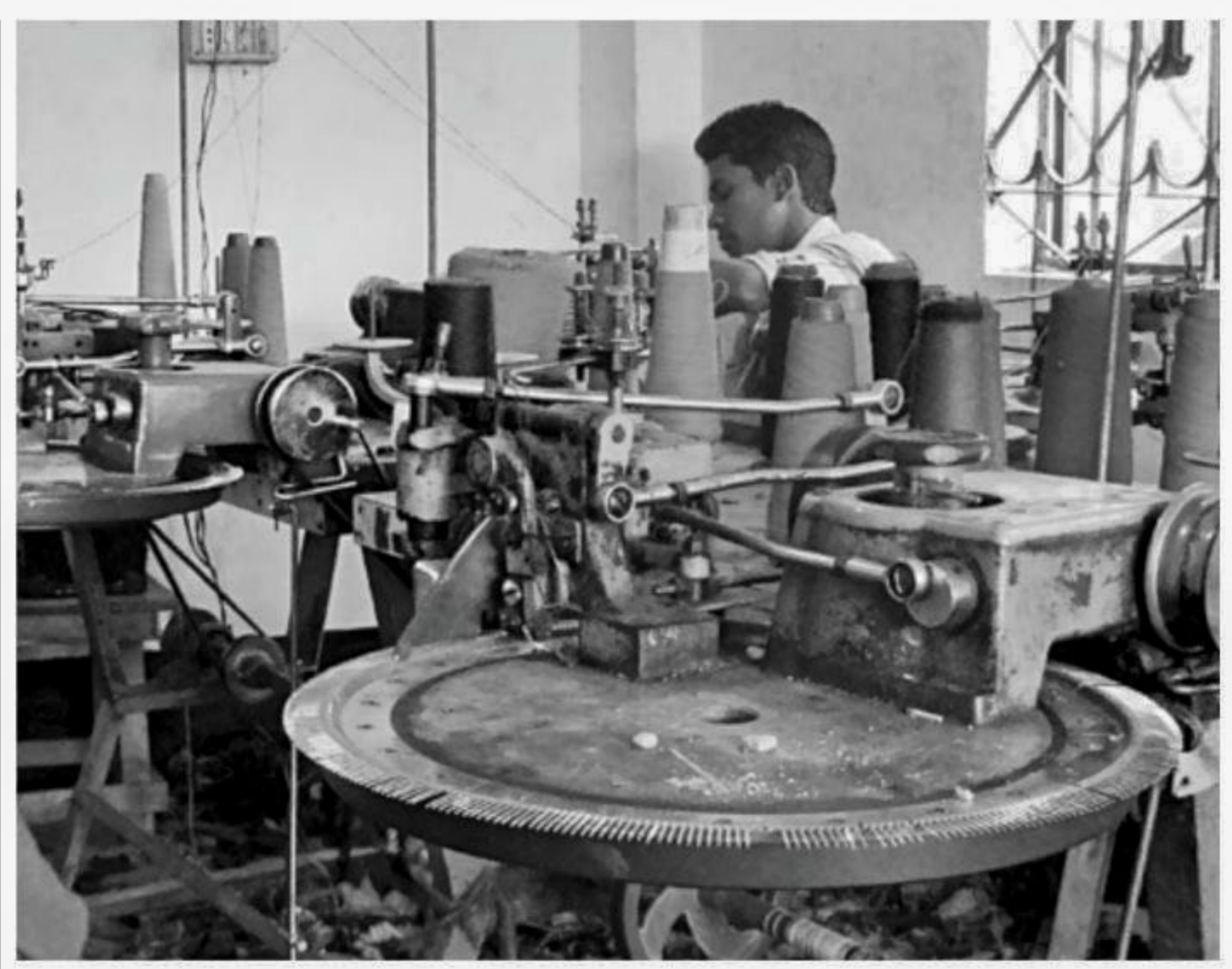
A hosiery factory at Nayarhat in Gobindaganj upazila under Gaibandha district sees only a little work as sale of the traditional product in the area sees drastic fall amid the transport problem due to countrywide weeks-long non-stop blockade enforced by the BNP-led 20-party alliance.

During primary interrogation the arrestees admitted their involvement in the robbery, said police.