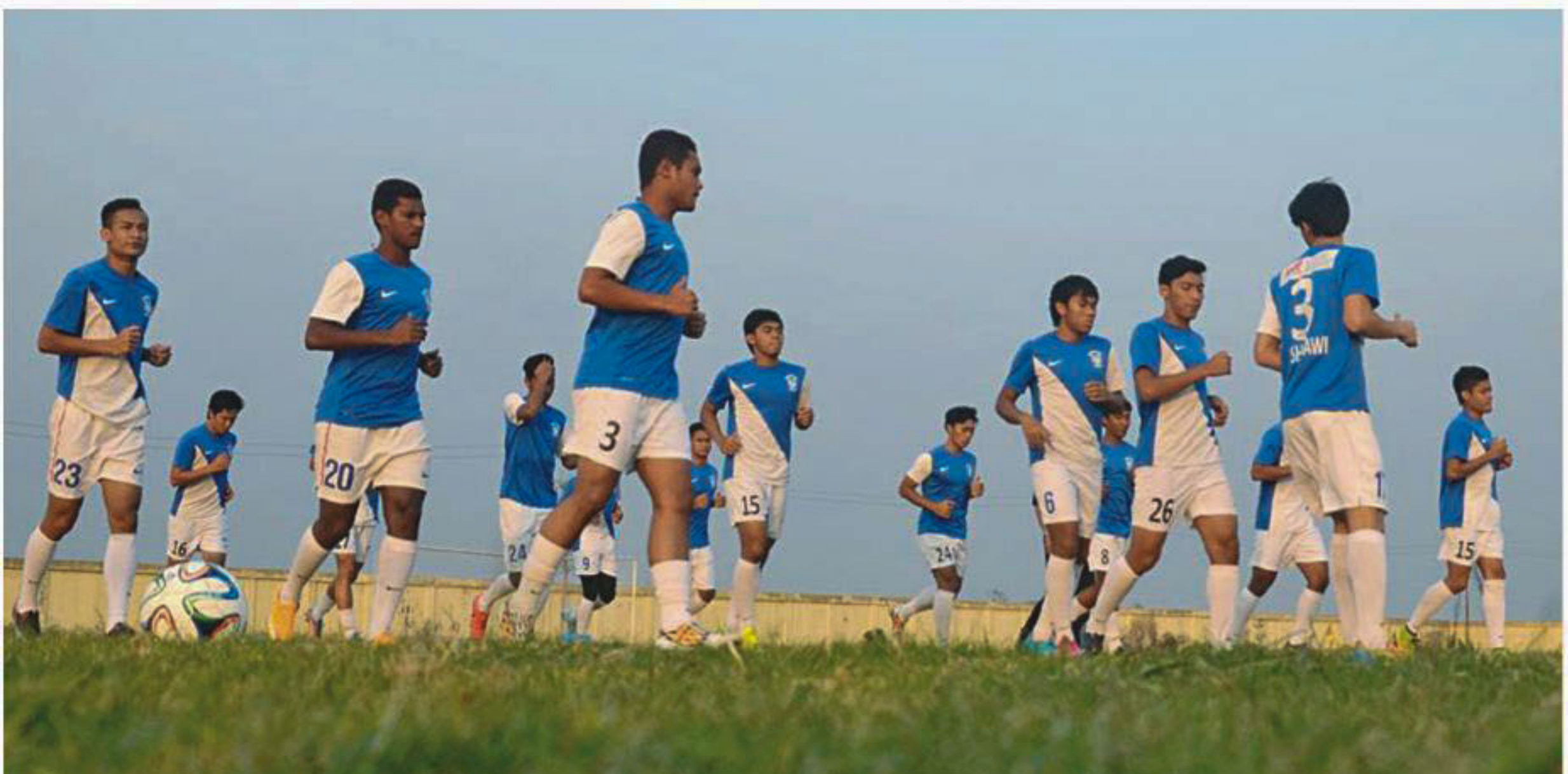
The Malaysian Olympic team, who are set to face Bangladesh tomorrow in the Bangabandhu Gold Cup opener, jog around the BFF Academy in Sylhet yesterday afternoon.