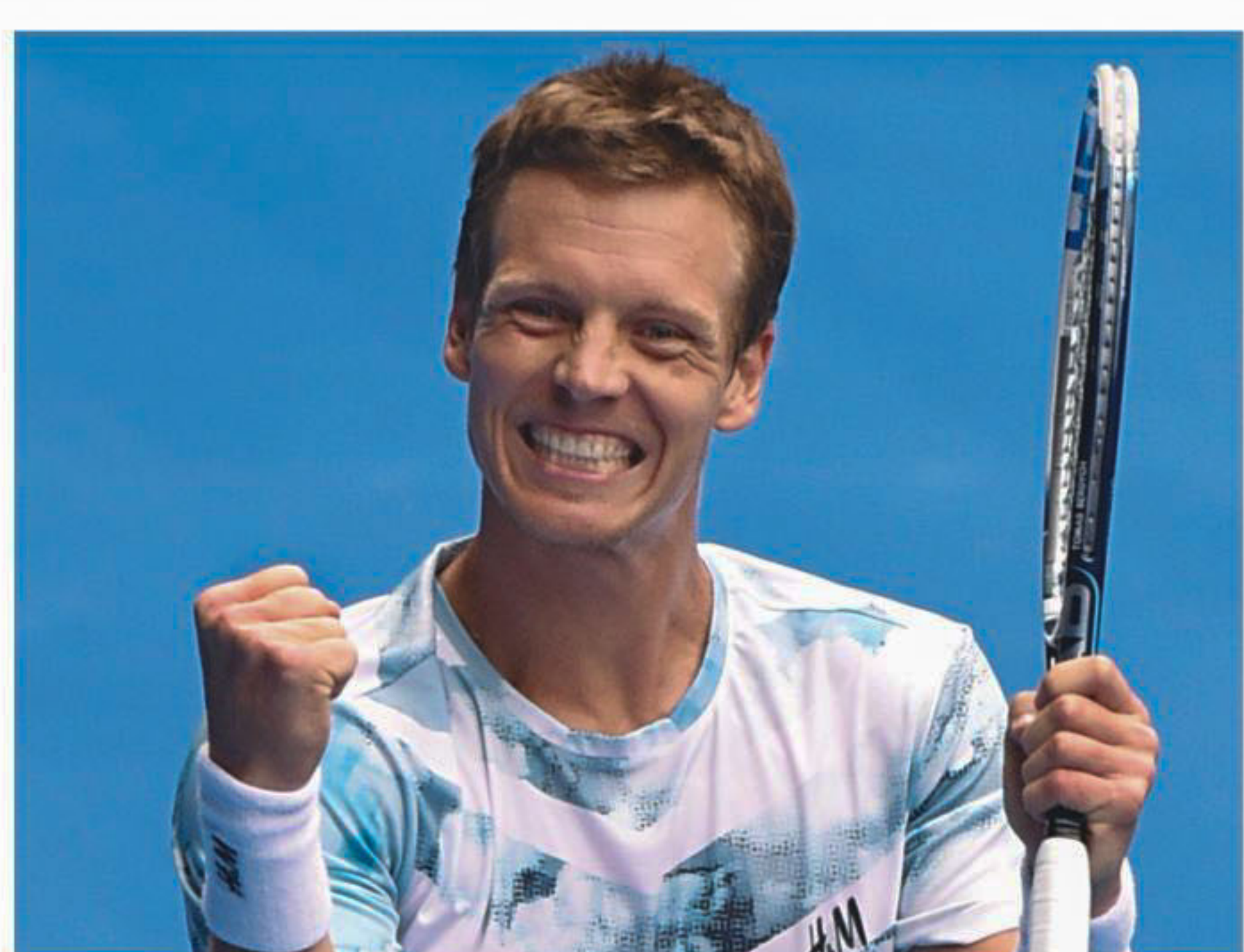
Tomas Berdych (L) of Czech Republic celebrates his win over Rafael Nadal in the Australian Open quarterfinals yesterday. Fan-favourite Nick Kyrgios (R) walks off the court disheartened after being beaten by Andy Murray on his home soil.

The visitors had their first training session at the BFF Academy in Sylhet, where the home team also had their training almost at the same time.