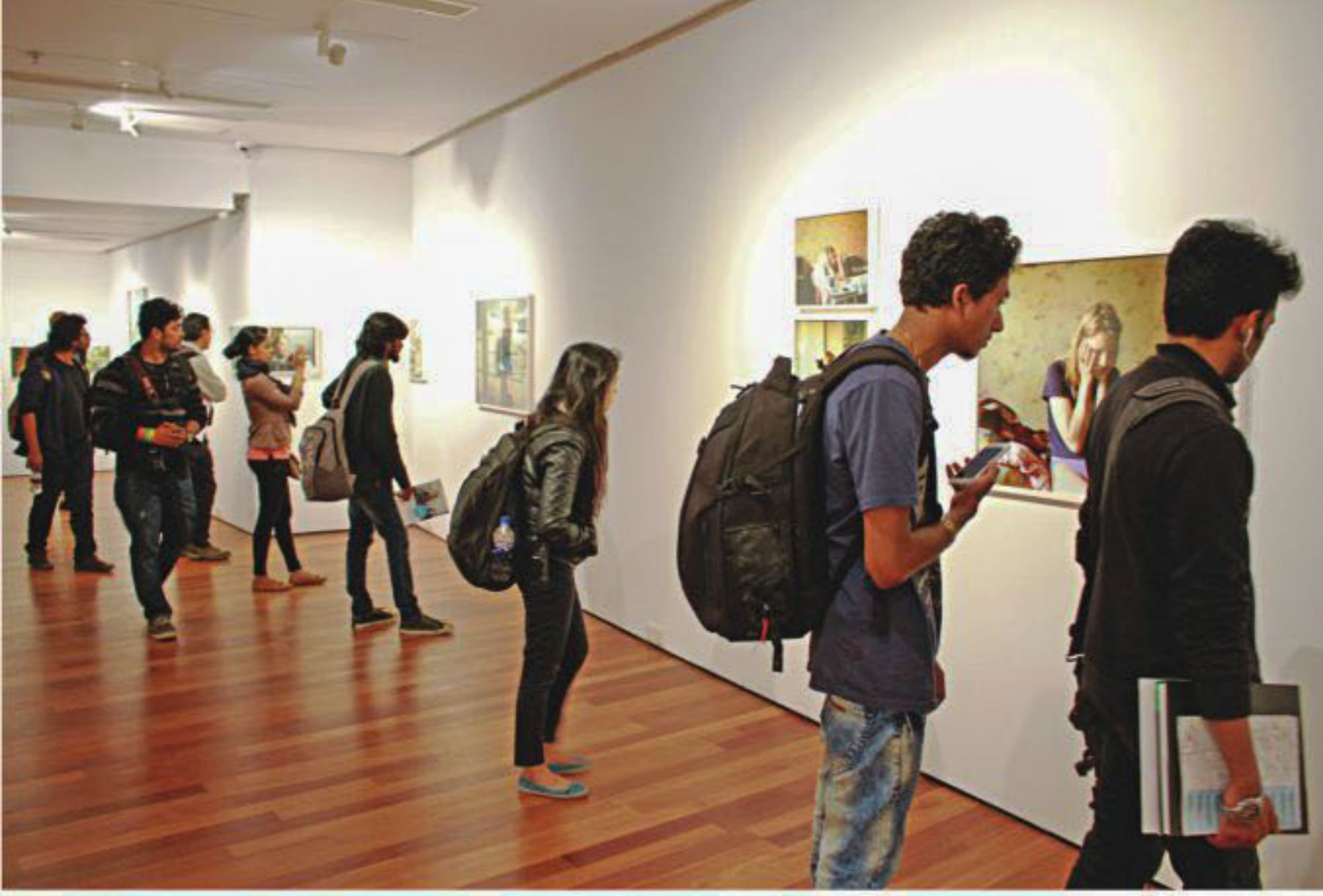
Visitors at the Arts Precinct; rickshaws carrying guests of Chobi Mela to the exhibit.