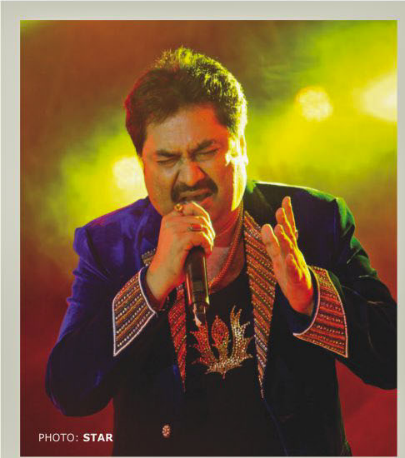
Bollywood playback singer Kumar Shanu performs at a musical programme at the Dhaka Officers' Club, celebrating Saraswati Puja. The daylong rituals and celebrations were held on January 25 at the club premises, celebrating the arrival of Devi Saraswati - the Hindu Goddess of knowledge, music, arts and science.