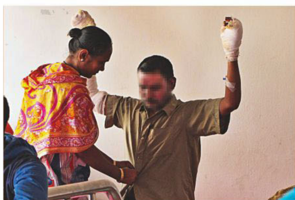
(Clockwise from top left) A pickup driver being brought to Dhaka Medical College Hospital's burn unit from Thakurgaon Sadar Hospital after coming under attack by arsonists on the Thakurgaon-Dinajpur highway at Uotrish Mile village under Thakurgaon sadar upazila early yesterday. A child meets his victimised father at the burn unit. Some of the victims of Friday's arson attack on a bus in Jatrabari recovering there. Unable to use his burnt hands, one victim being fed by his wife. Another wears a shirt for the first time after being grievously injured.