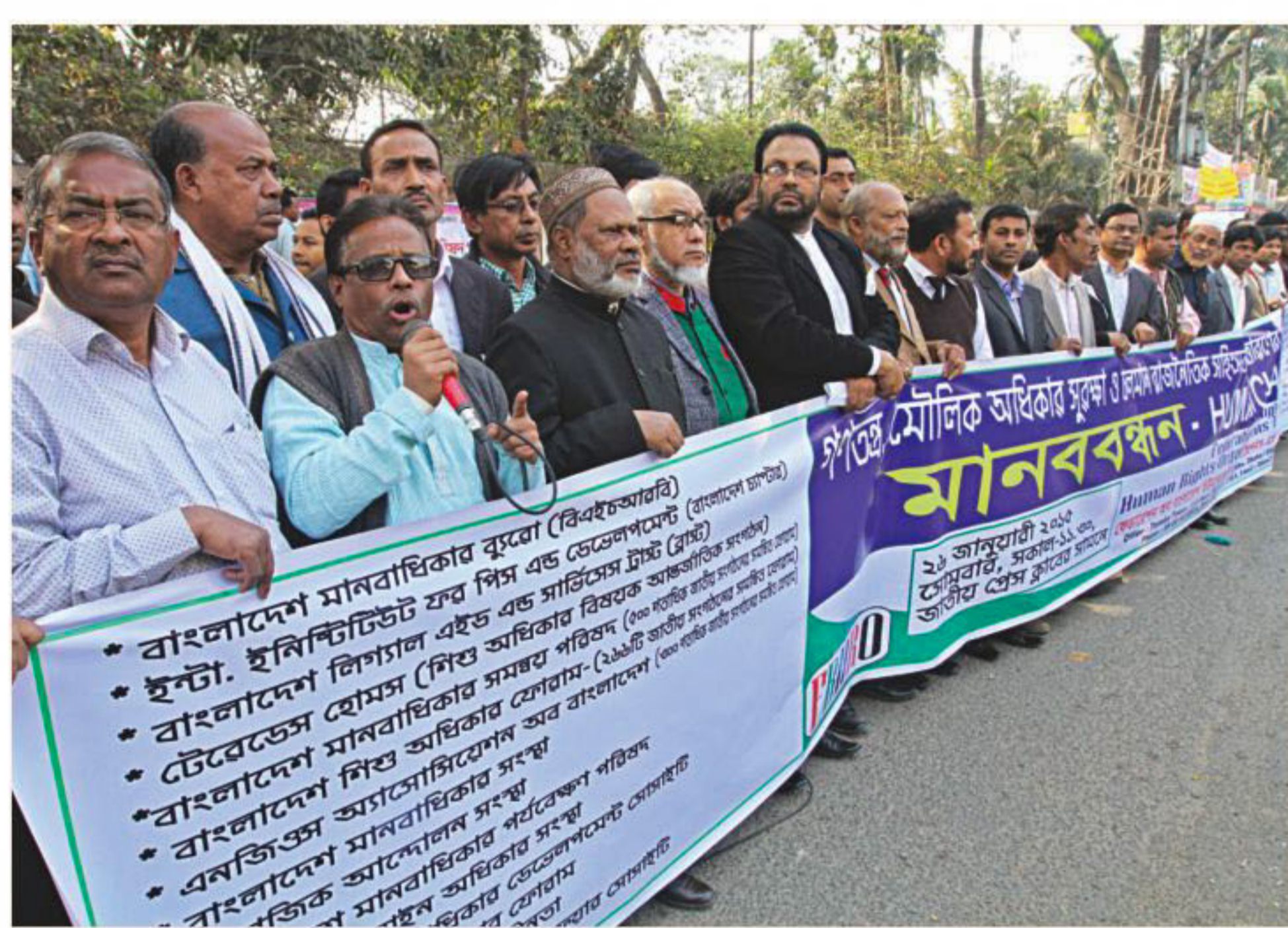
The Federation of Bangladesh Human Rights Organisations forms a human chain in front of Jatiya Press Club in the capital yesterday demanding ensuring democracy, protection of human rights and an end to the ongoing political violence centring the blockade being enforced by the BNP-led 20-party alliance.