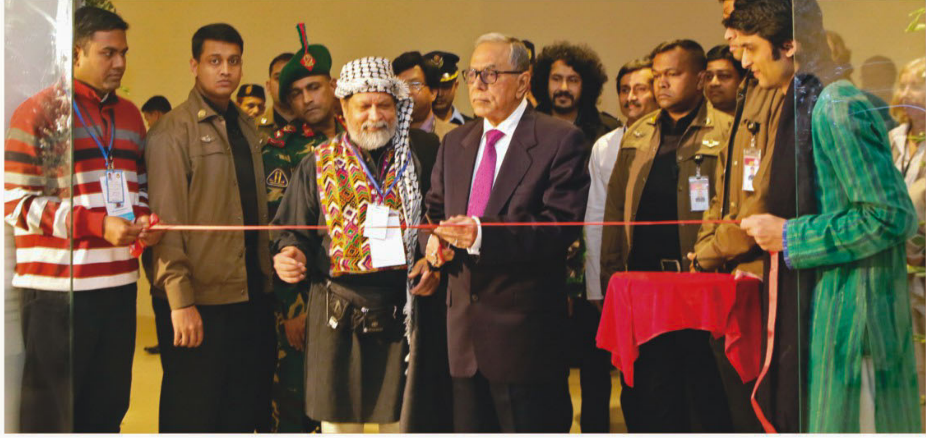
President Abdul Hamid (C) inaugurates Chobi Mela VIII.