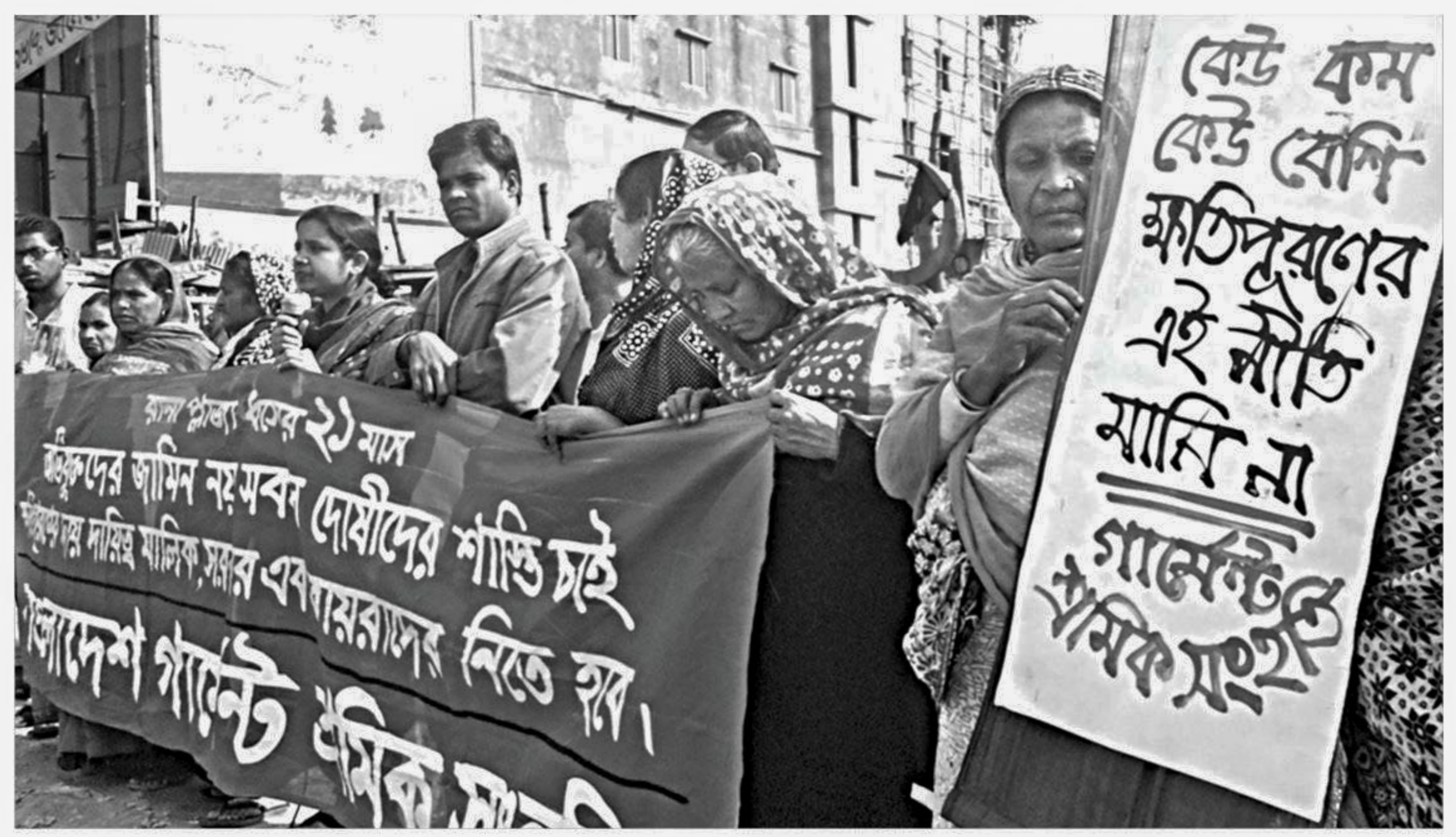
Survivors of Rana Plaza collapse and family members of those killed and injured form a human chain under the banner of "Bangladesh Garment Workers' Solidarity" at the collapse site in Savar outside the capital yesterday demanding immediate compensation, and punishment for those responsible for the tragedy that left at least 1,136 people dead on April 24, 2013.