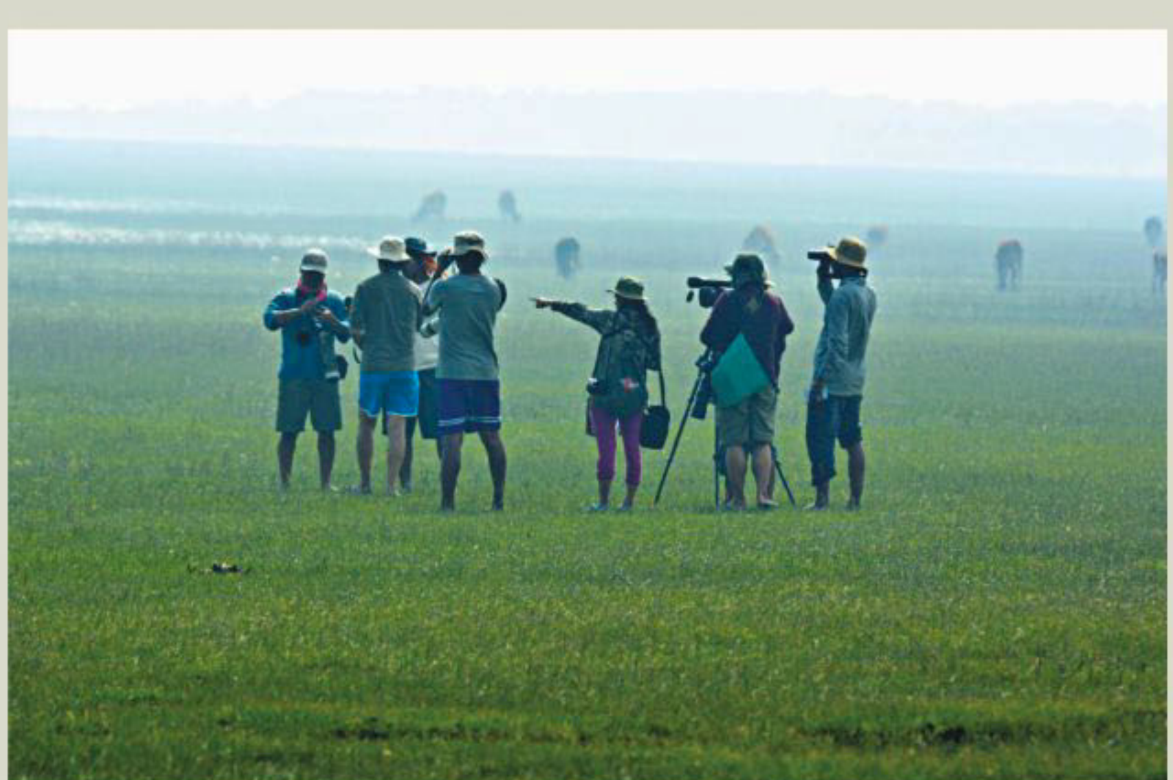
The team at work at Char Kukri-Mukri.