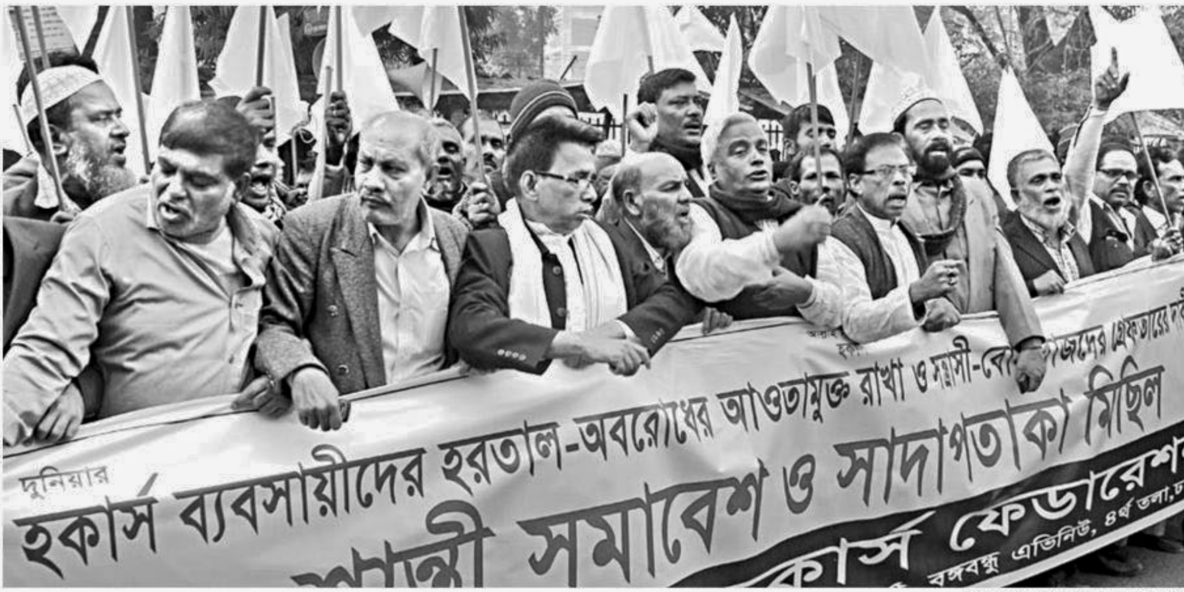
Bangladesh Hawkers' Federation brings out a white flag procession in front of Jatiya Press Club in the capital yesterday demanding that hawkers' trade be kept outside the purview of hartals and blockades.