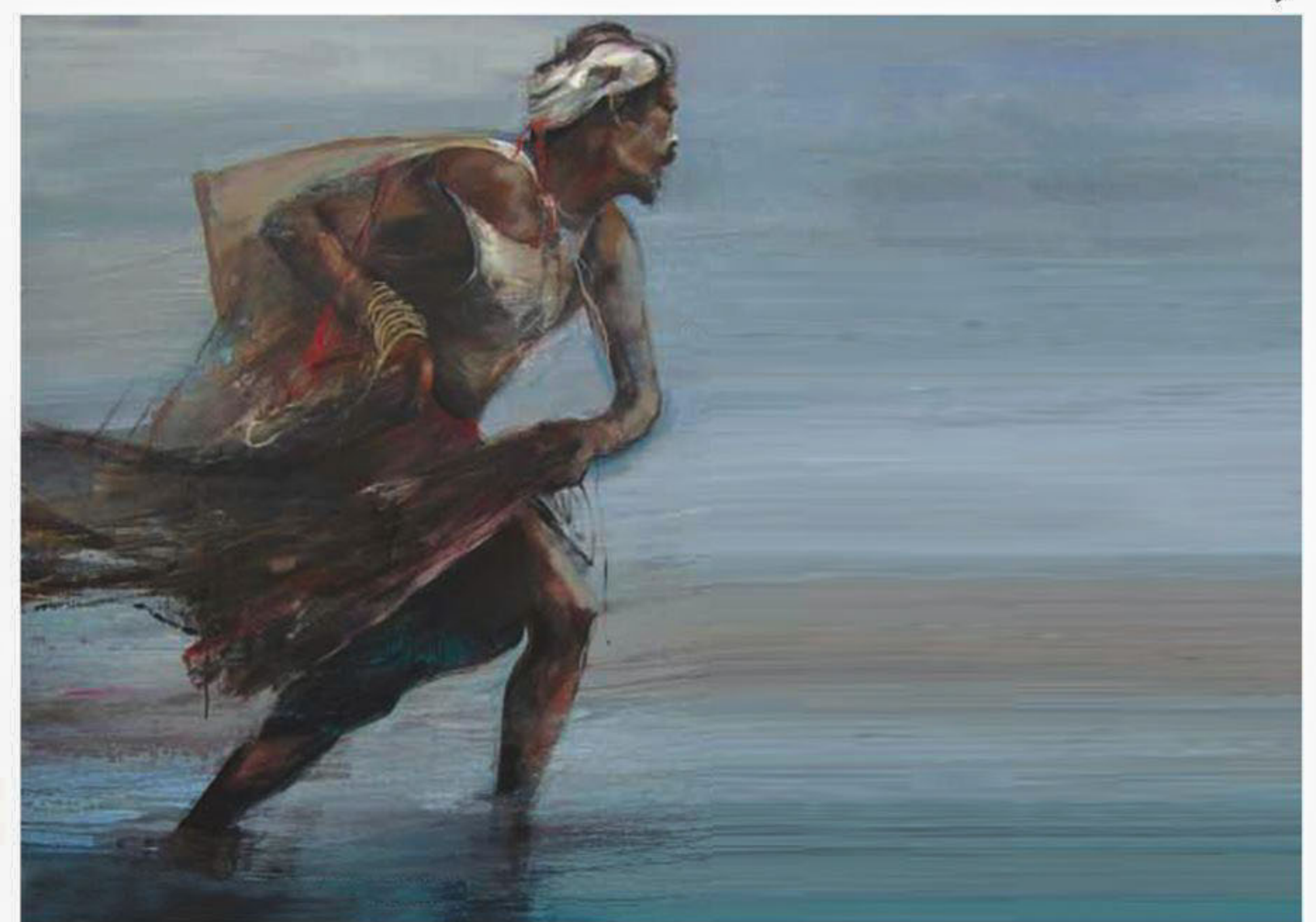
An artwork by Jamal Ahmed.

FAYZA HAQ Well known artist Jamal Ahmed's muses are the dusky beauties and fishermen that people his works. His talent lies in quick sweeps that capture the beauty of the sand, distant horizons, the sea and fishermen. There is also the miracle of alluring beauties, which he sketches on paper. They take on realistic tones as they frolic with pigeons, beautify themselves with single flowers or wait for their beloved, in a tense, crouched fashion. Athena Gallery, in South Badda, presents the wonder of the crayons