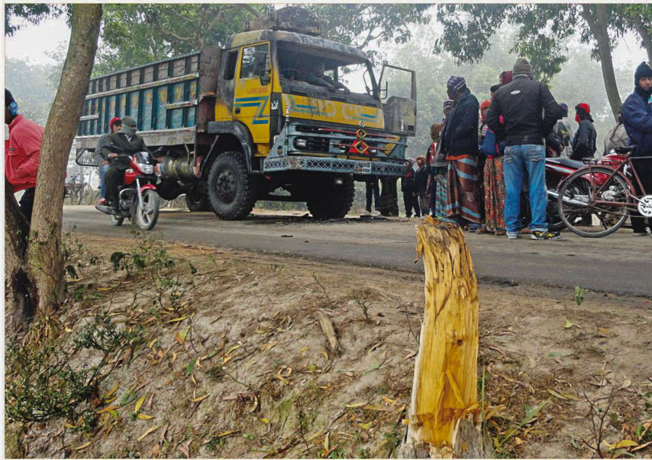
The ongoing blockade means not only loss of people's lives and destruction of their properties but also decimation of roadside trees, which are chopped down at random to block vehicles like this truck on Dinajpur-Parbatipur road. It was stopped, by felling four trees, and then torched in Hajimor area of Chirirbandar upazila around 3:00am on Tuesday.

A team of Jahurul Islam Medical College and Hospital, Bhagalpur provided free medical services and medicines to 6,000 pilgrims who attended the Ijtima held in two phases from January 9 to 18 in Tongi. Each team consisted of five doctors, five nurses, three ward-boys and management staff ensured services from 8:00am to 11:00pm everyday. Navana Pharmaceuticals Ltd, a sister concern of Islam Group, assisted the team.