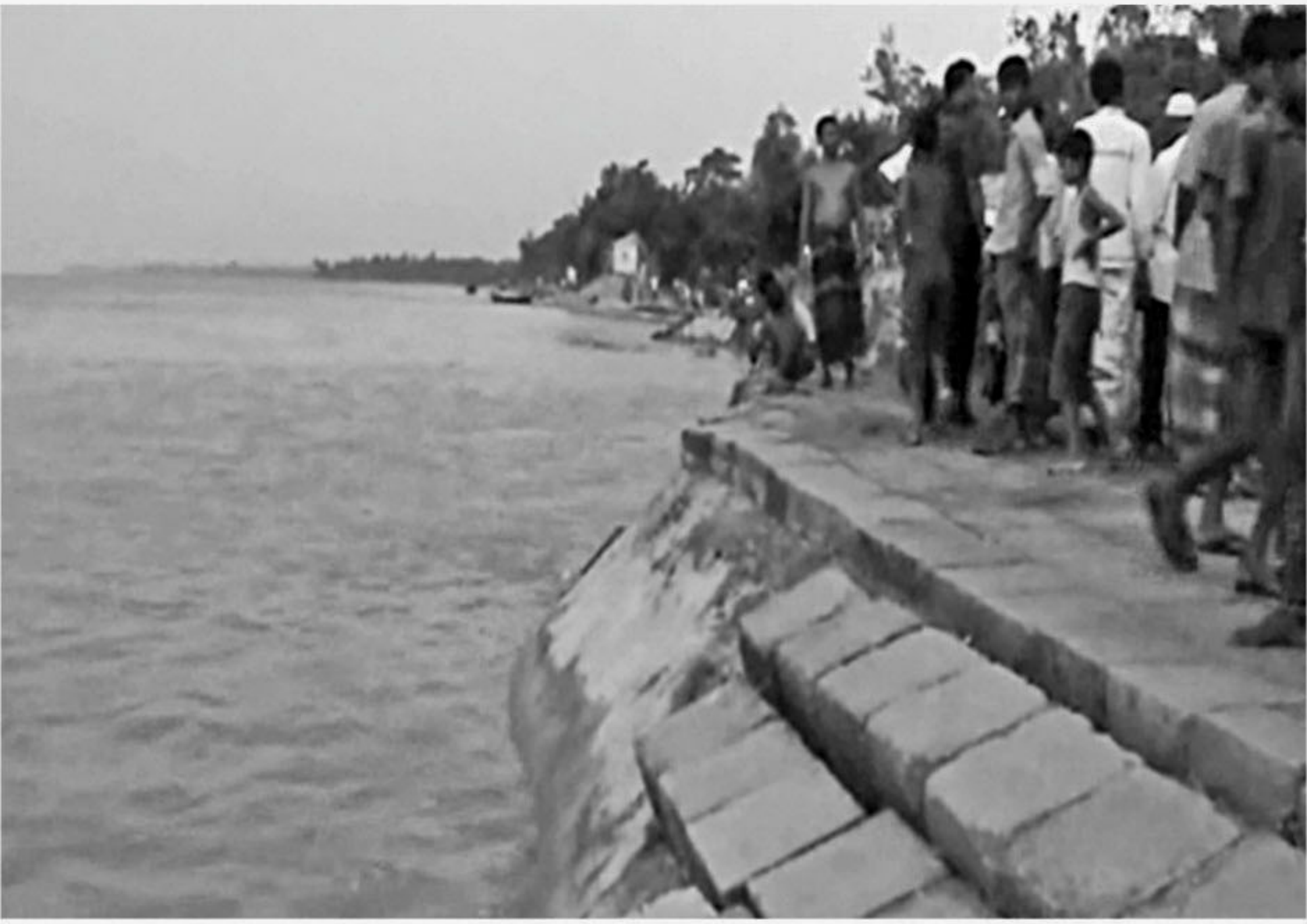
A portion of the protection embankment on the Jamuna River collapsed under the pressure of water at Bhatpara in Shahjajpur upazila under Sirajganj district early yesterday.