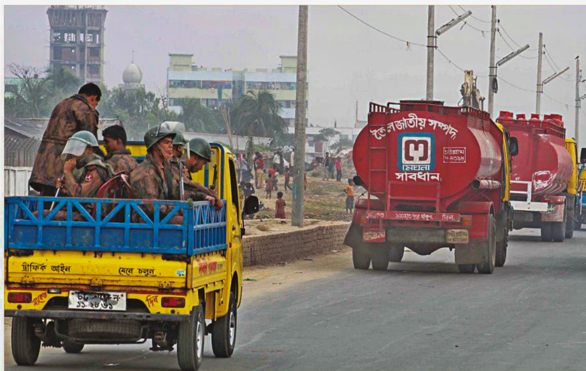
As part of increased vigilance by law enforcers, a BGP team escorts a tank lorry in Patenga of Chittagong yesterday to resist attacks from supporters of the ongoing blockade enforced by the BNP-led 20-party alliance.