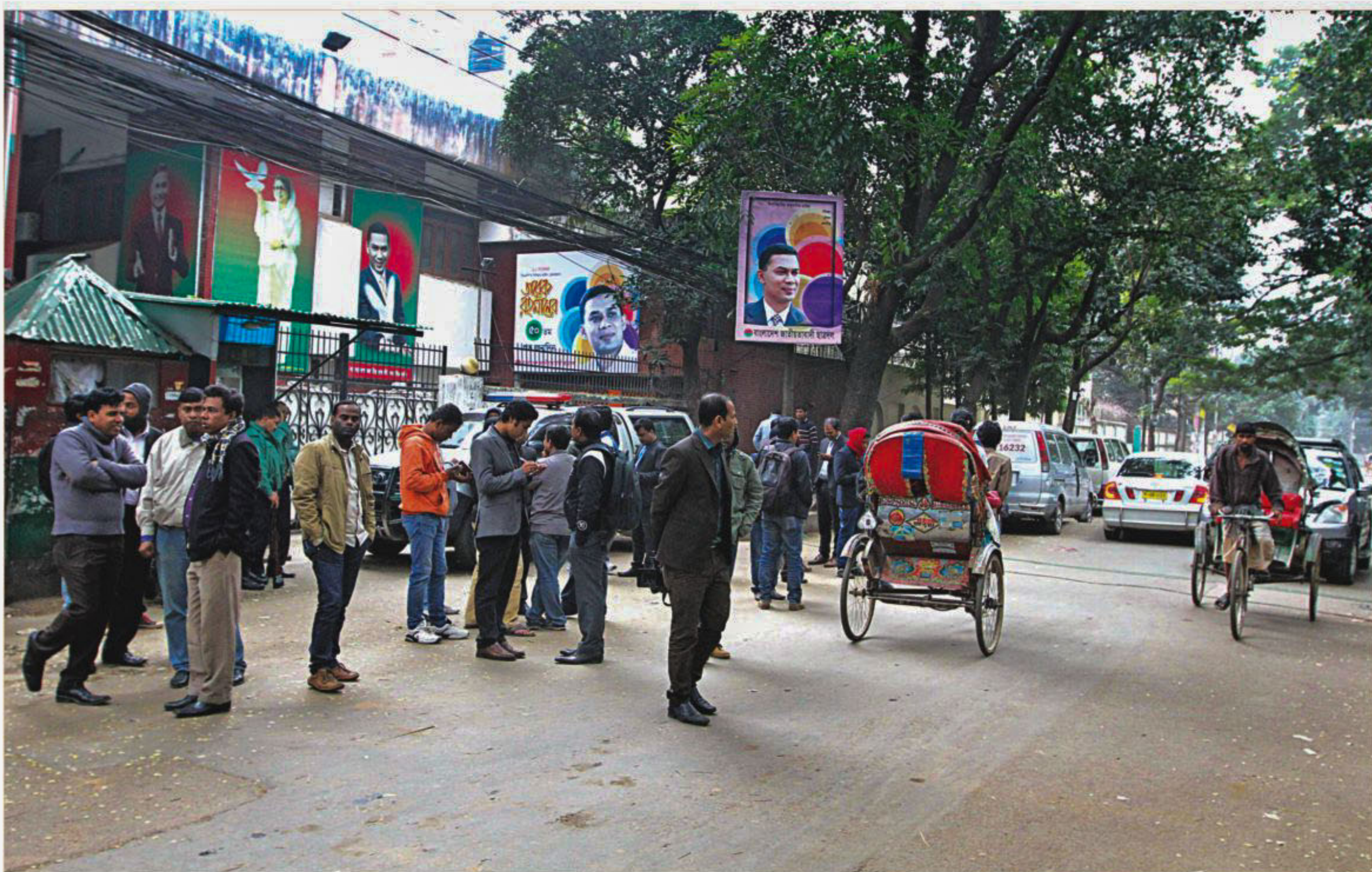
With restrictions lifted, cars and rickshaws ply the road in front of BNP chairperson's political office in Gulshan yesterday. Police vans, water cannons and a huge contingent of law enforcers that had been barricading the road for more than two weeks were withdrawn early yesterday.