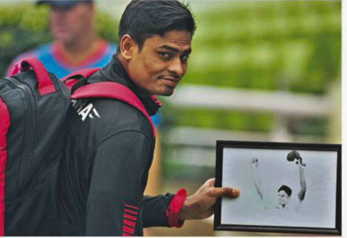
PICTURE WITHIN A PICTURE: Spinner Taijul Islam has his hat-trick moment framed.

wicket haul in the National Cricket League the same year. That was followed by a hard-fought five-for on his Test debut in the West Indies. His ability to use the bounce and get wickets compelled selectors to include him in the World Cup, where bouncy pitches are expected to dominate. Taijul has come a long way since his debut three months ago. However, history suggests that he has a long ricketty road ahead. The left-armed exuded confidence during the pre-World Cup press conference. "I want to finish as one of the event's top ten wicket-takers." It was an ambitious statement, but one that had been heard before. The question that remains is whether Taijul can overcome the uncanny sense of satisfaction that is supposed to have had led to the downfall of a number of young Tigers and break the jinx.