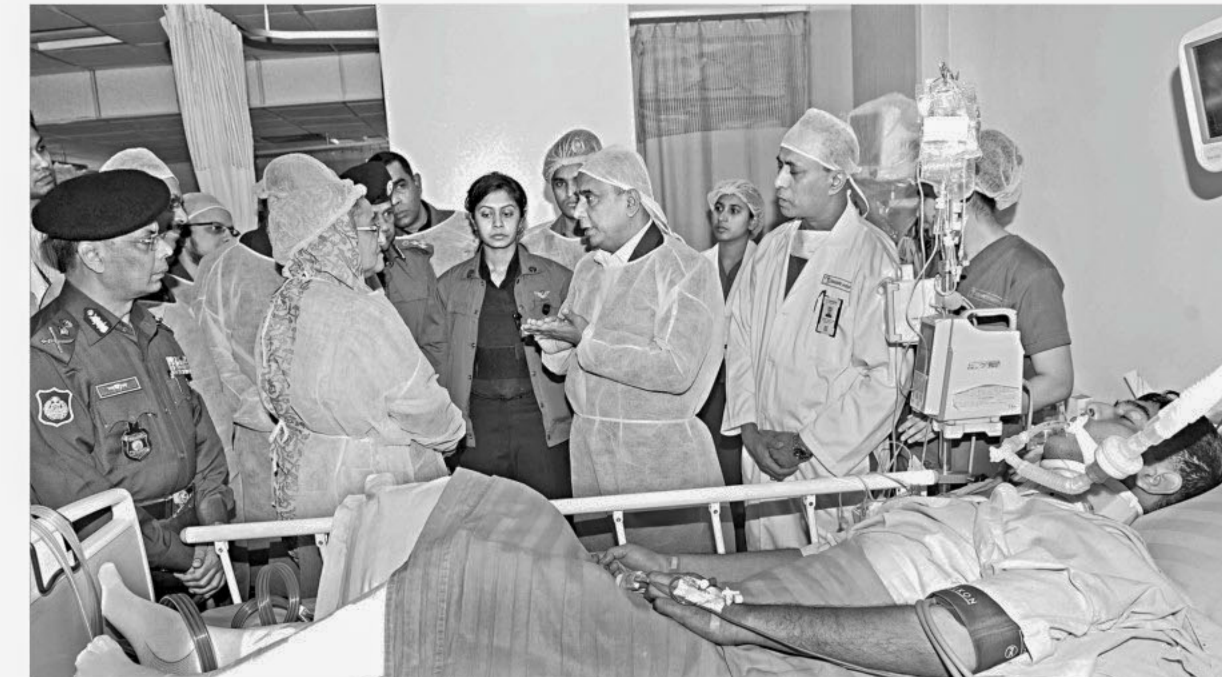
Prime Minister Sheikh Hasina visits Square Hospitals yesterday to see the policemen injured in a bomb attack near Matsya Bhaban in the capital on Saturday.