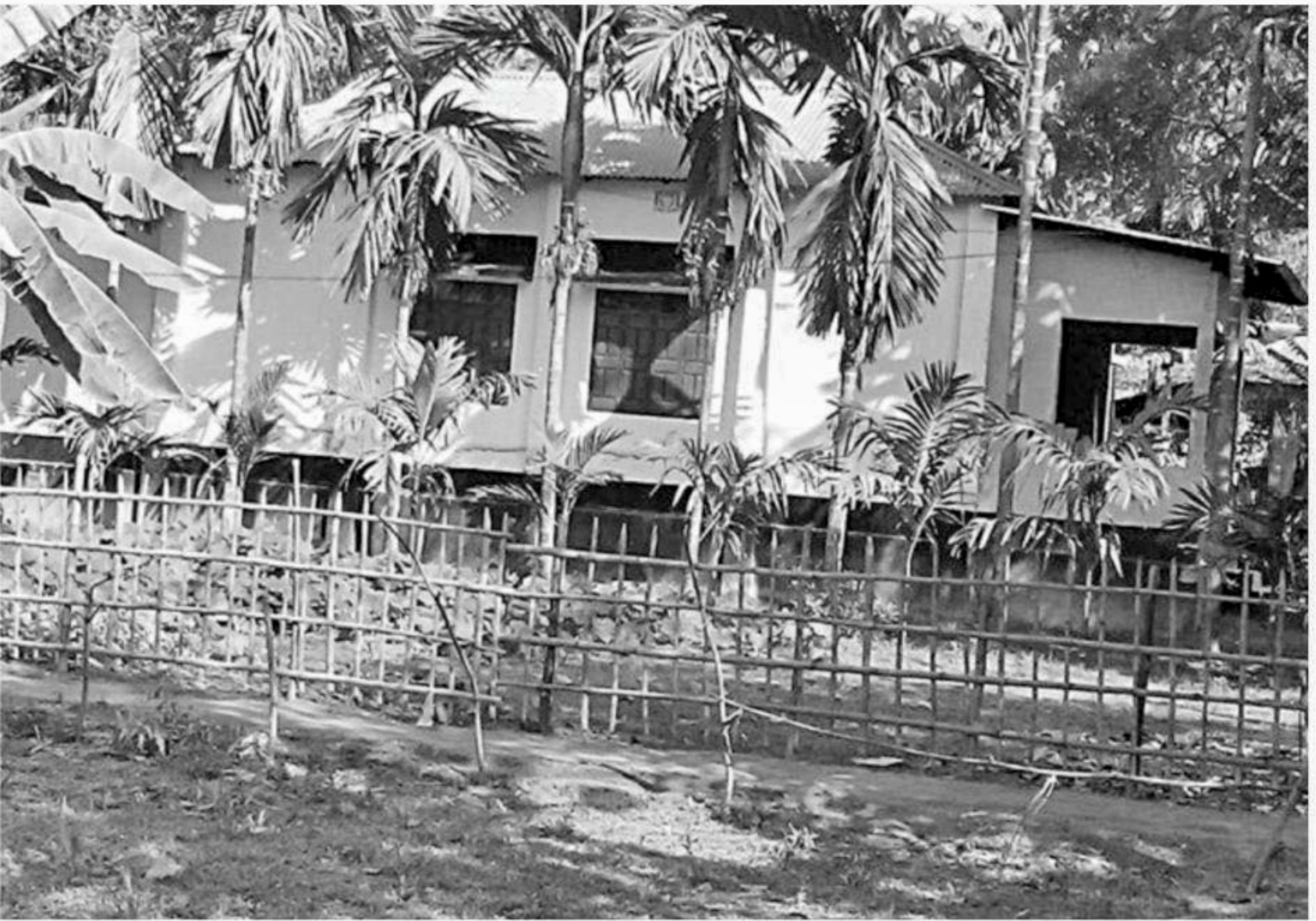
A local influential person has constructed a house on the land of a Hindu widow at Khorarpur Shahitiri village in Lalmonirhat district to perpetuate his illegal occupation of the 16-decimal land.