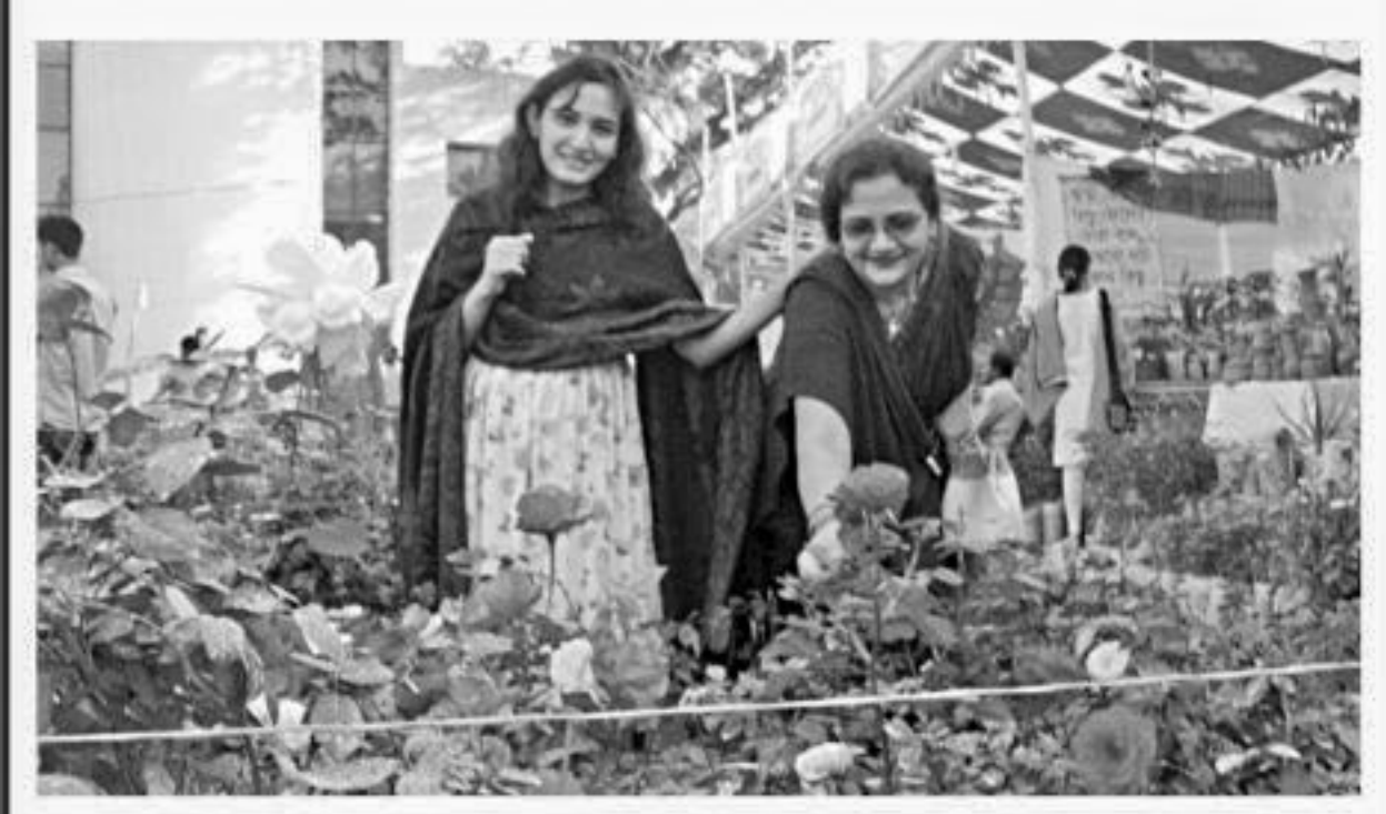
Visitors at the Pushpa Mela (flower fair) organised by Mymensingh District Nursery association on the premises of Mymensingh Town Hall.