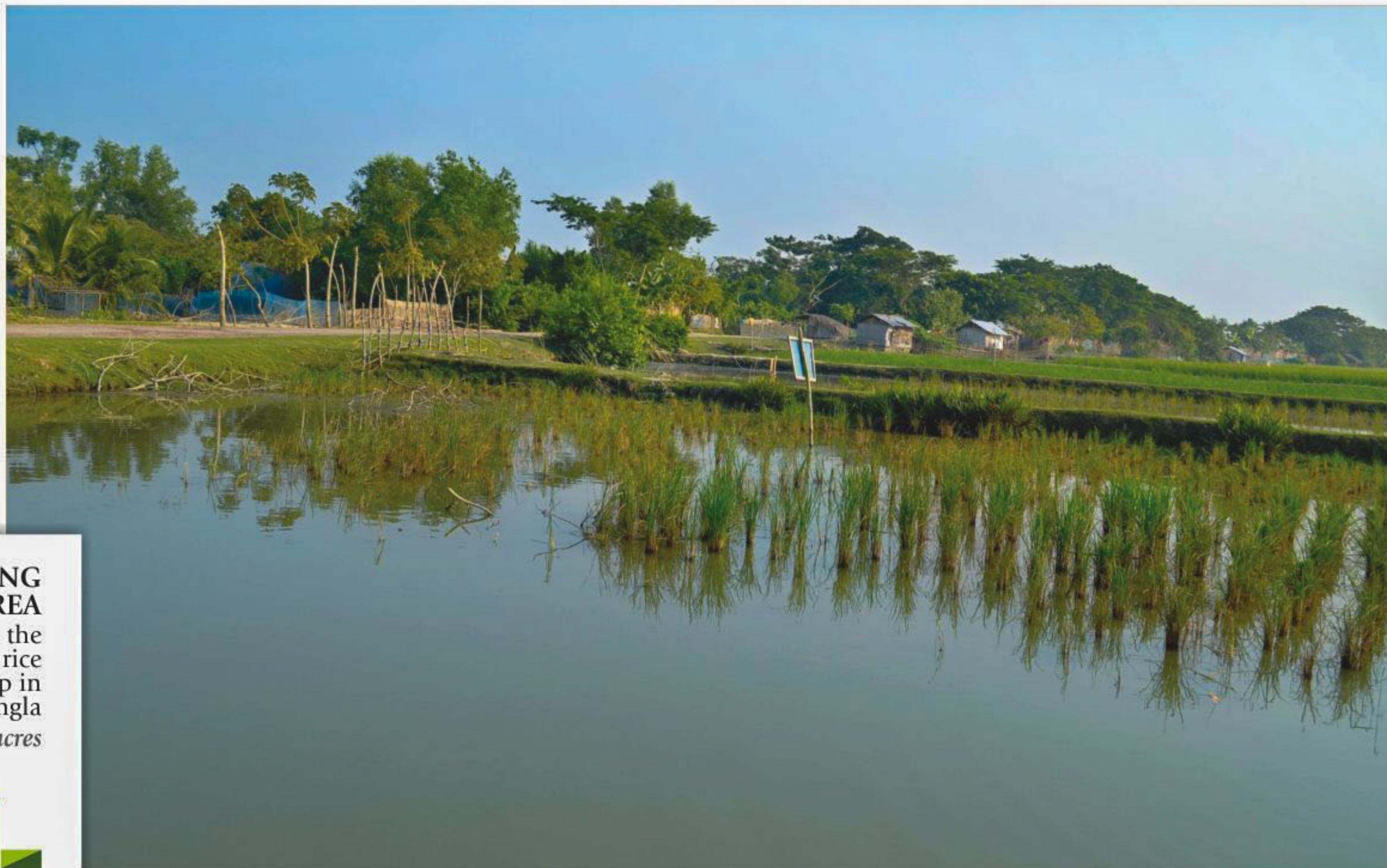
A farmer had attempted to grow rice on this submerged piece of land in Mongla upazila in Bagerhat but extreme salinity in the soil allowed only a handful of plants to survive, which are unlikely to be of any use. The photo was taken recently.