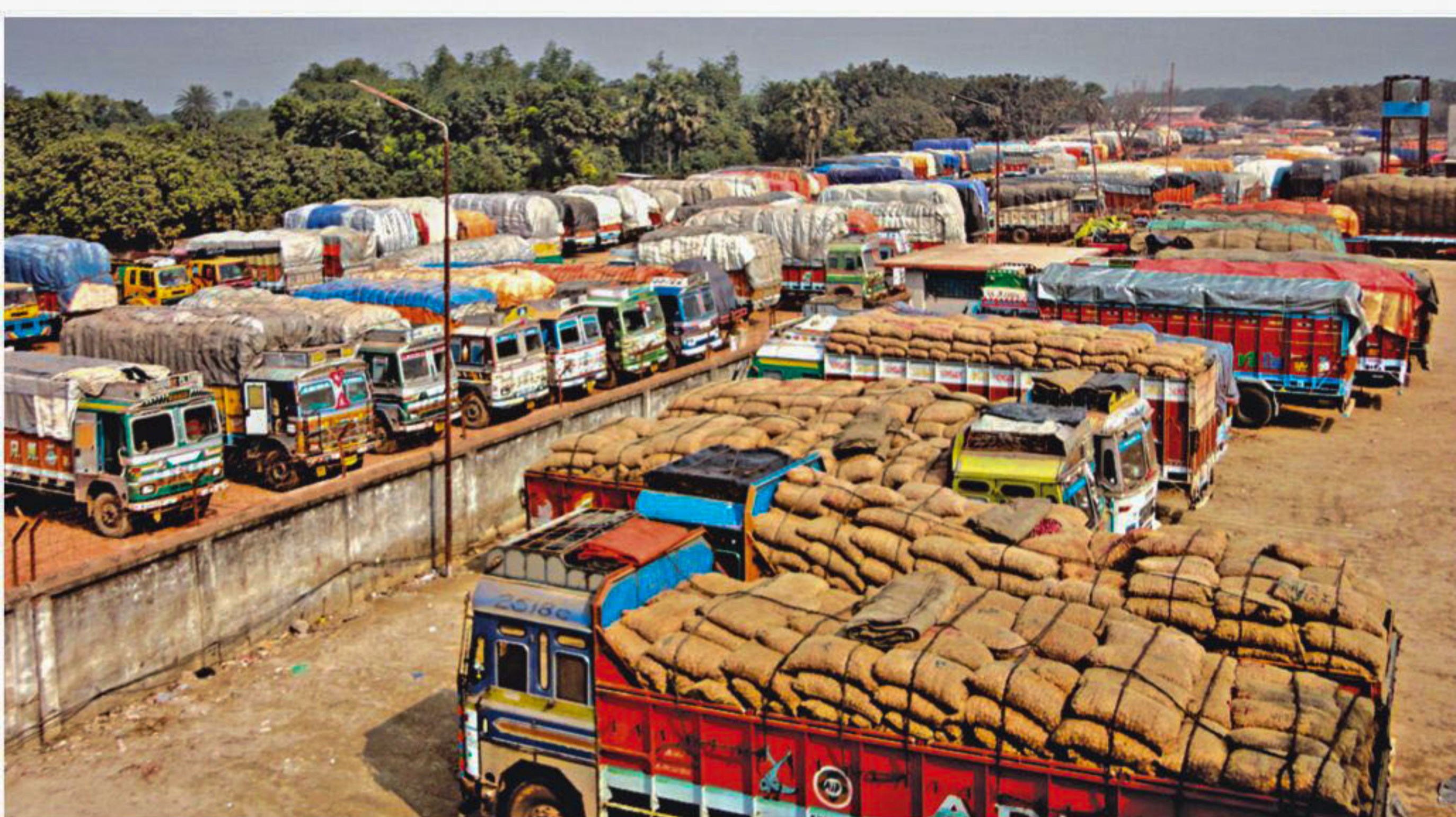
Around 1,300 Indian trucks loaded with goods for Bangladesh are stuck at Sonamasjid Land Port in Chapainawabganj as the indefinite nationwide blockade enforced by the BNP-led 20-party alliance continues to hurt trade. Perishable items in many trucks have reportedly started rotting.